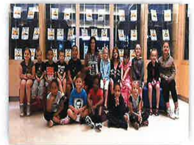
BHS Girls Tennis- SWCL B Champs Congratulations!