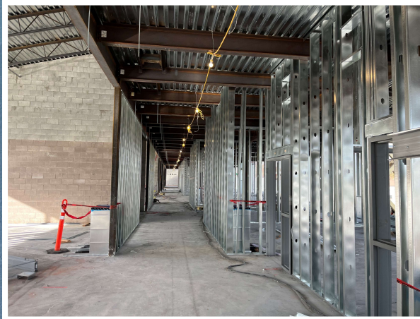
L2 Framing and Hollow Metals