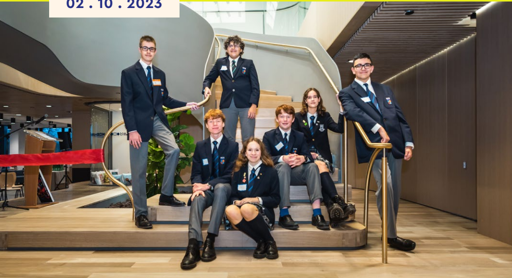
Students of the Senior School in the newly built entrance hall.

A tremendous amount has happened since our December 'Stories from the Journey' report . Here's how the KCS Senior School experience continues to grow thanks to dedicated staff, students, Learning Partners, and Toronto as our campus.