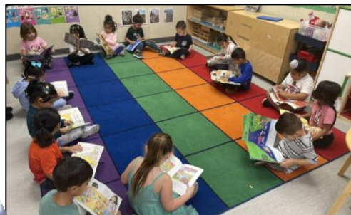
Villalovoz students reading books they checked out from the school library.