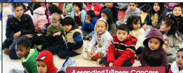
Attending Winter Concert