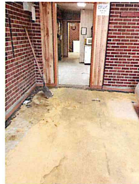
Paint and New Carpet in the Transportation Building