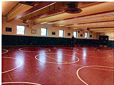
Old Wrestling Room