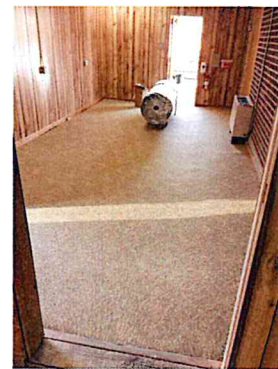
Paint and New Carpet in the Transportation Building