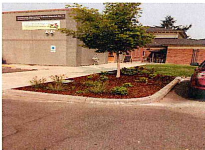
Pruning and Beauty Bark