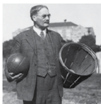
Dr. James Naismith