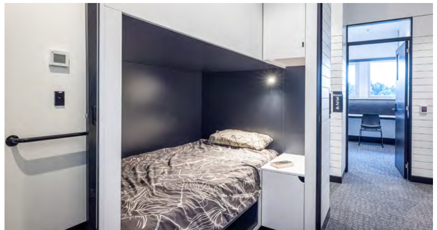
Harlin House (Years 9 to 12) ▲ Griffith House (Years 5 to 8) ▼

Harlin House is home to boys in Years 9 to 12. Individual rooms provide a space to recharge, while social areas foster connection.