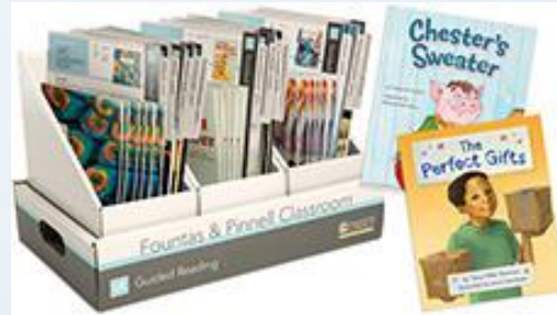
Fountas & Pinnell Guided Reading