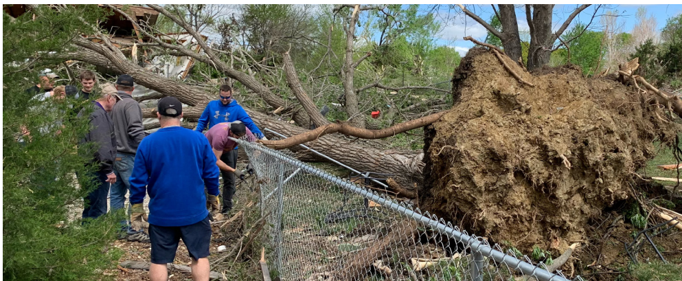
Volunteers, including members of the ACHS football team, survey tornado damage.