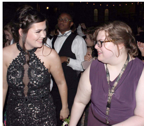
Students at Andover Central High School dance at their "Midsummer Night's Dream" themed prom in the gym. Andover High School had a "Midnight Voyage" prom located at the Wichita Boathouse.