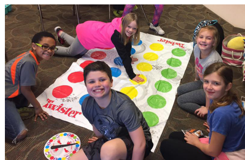
Robert Martin Elementary students participate in Global School Play Day. The class took a break from screens, electronics and structure to do what they do best...play!