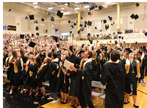
Seniors at Andover Central throw their caps to celebrate their graduation. Congratulations to all our 2017 graduates!