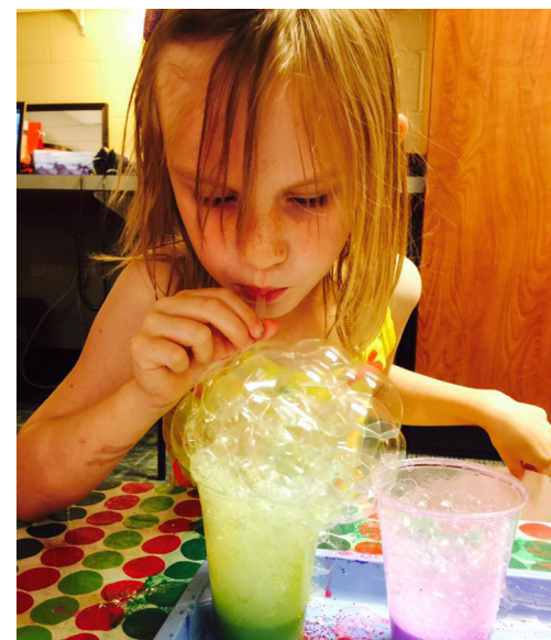
Prairie Creek Elementary first graders have a Bubble Bonanza with bubble wands, painting, gum and play! The students had themes for the last ten days of school and to kick it off was all things bubbles.