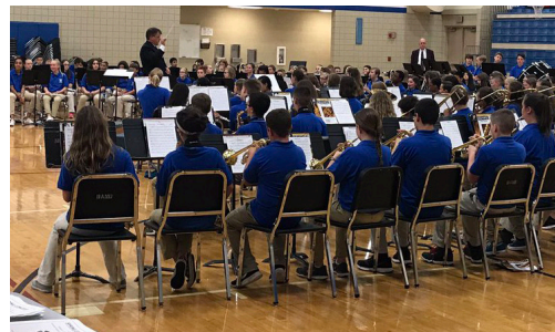
Andover Middle School's largest sixth grade band in school history performs their spring concert. There are 182 students in the band.