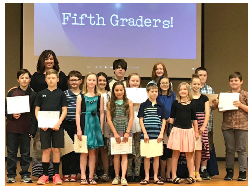
Andover eCademy promotes 22 fifth graders to sixth grade. Afterward, families celebrated the students' achievements at a reception.