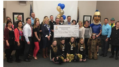
The Andover Advantage Foundation Grant Squad visits the schools and awards a total of $80,802! The Foundation has surpassed the $1 million mark in grants and district-wide projects over the past 20 years.