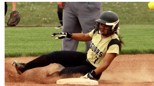
An Andover Central High School softball player slides safely into base. The Jags pulled off an epic comeback in the 4A-DI regional game, scoring 12 runs in the final inning to win the title on their home field.