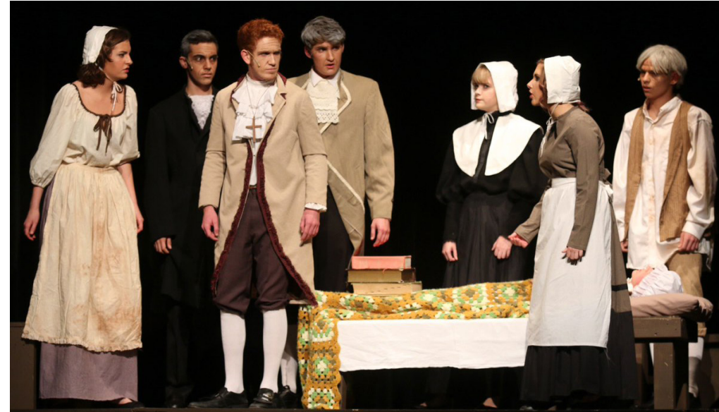
Andover Central High School students take on the Salem witch trials in their Spring showing of The Crucible . Andover High School students performed a more comedic Spring show, called Anatomy of Gray . Both schools were nominated for Jester Awards for the Fall plays.