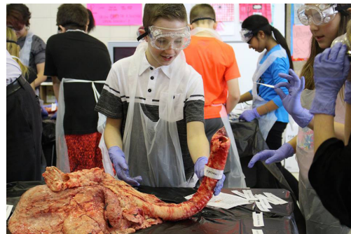
Fifth graders at Sunflower Elementary dissect cow lungs, using straws to blow air into the lungs and watch them inflate.