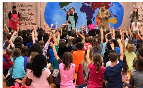
Andover High School theatre students ask Cottonwood Elementary for volunteers during their Folk Tales for Fun show.