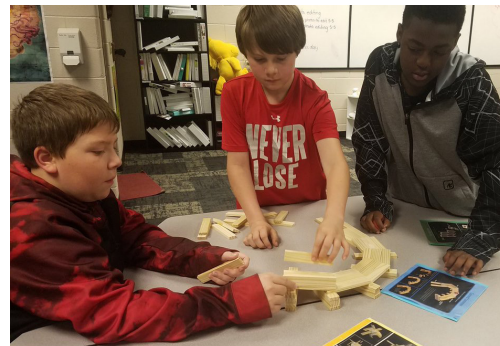
Andover Central Middle School students build and create contraptions in Design and Modeling class.