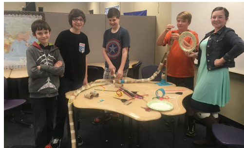
Andover eCademy middle school students have science fun by creating roller coasters during an In-House day. The hands-on project taught them about potential and kinetic energy.