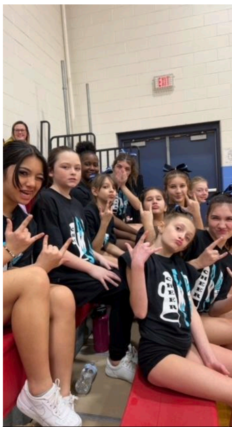
Titans Cheerleaders pose in the bleachers at a recent basketball game