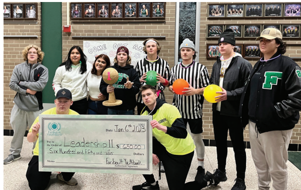
Faribault Youth Bank ayaa si sharaf leh u kafaala qaaday xaflada.

Ardayda ka socota Hogaaminta II waxay marti galiyeen Glow in the Dark Dodgeball Tournament oo kor u qaaday $1,020 Ruth's House of Hope.