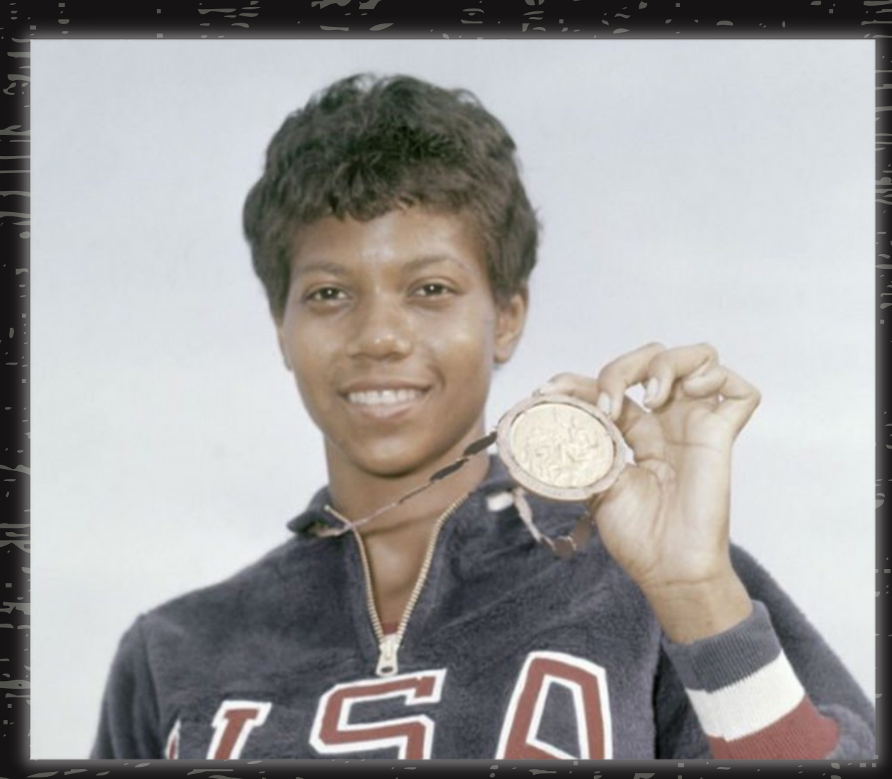
Track & Field Star Wilma Rudolph