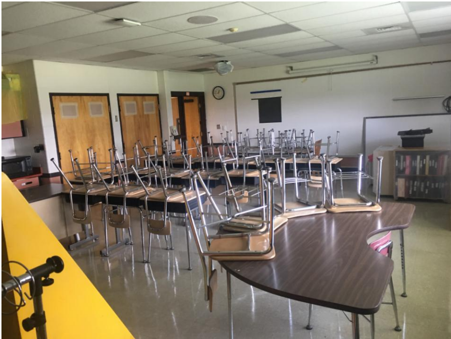
View of completed room..