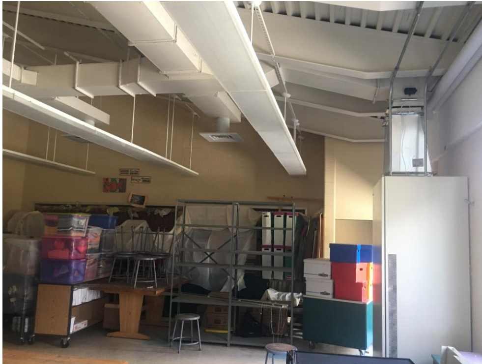
View of ductwork and VUV nearing completion in BES Art Room.