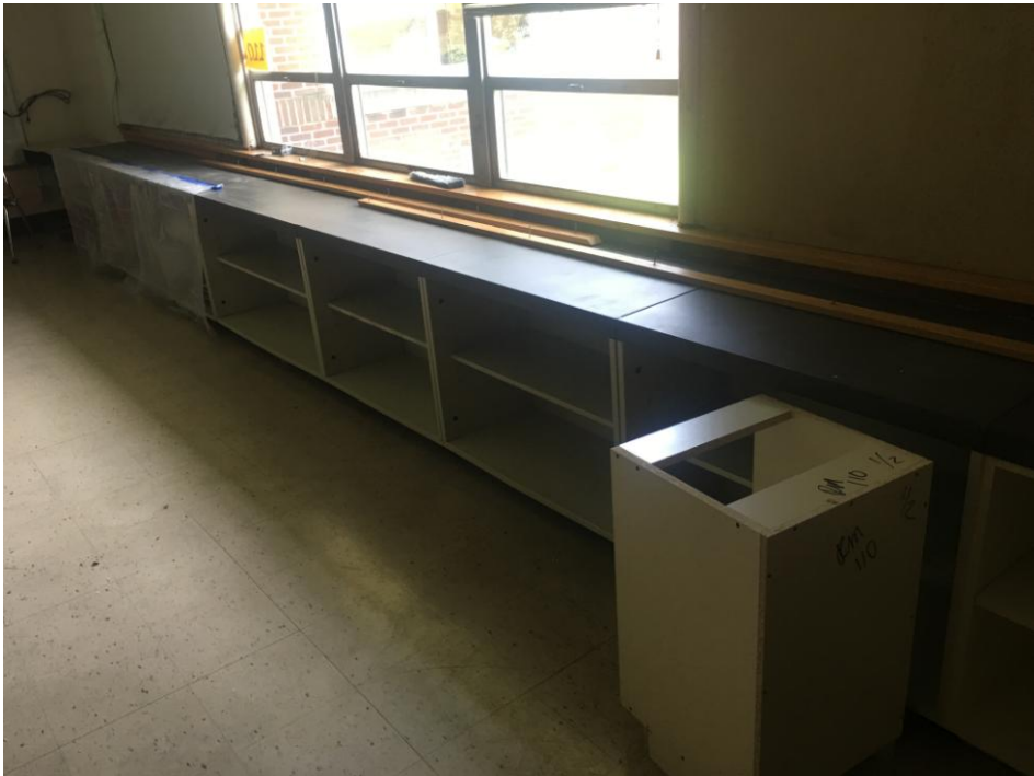
View of new casework at AES .