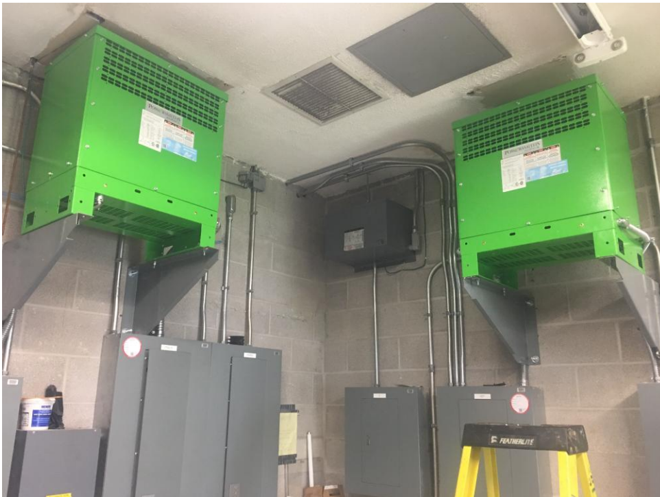
View of new transformers at AES in Main Electrical Room.