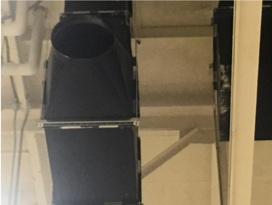
View of new duct ready for duct sock at BHS.