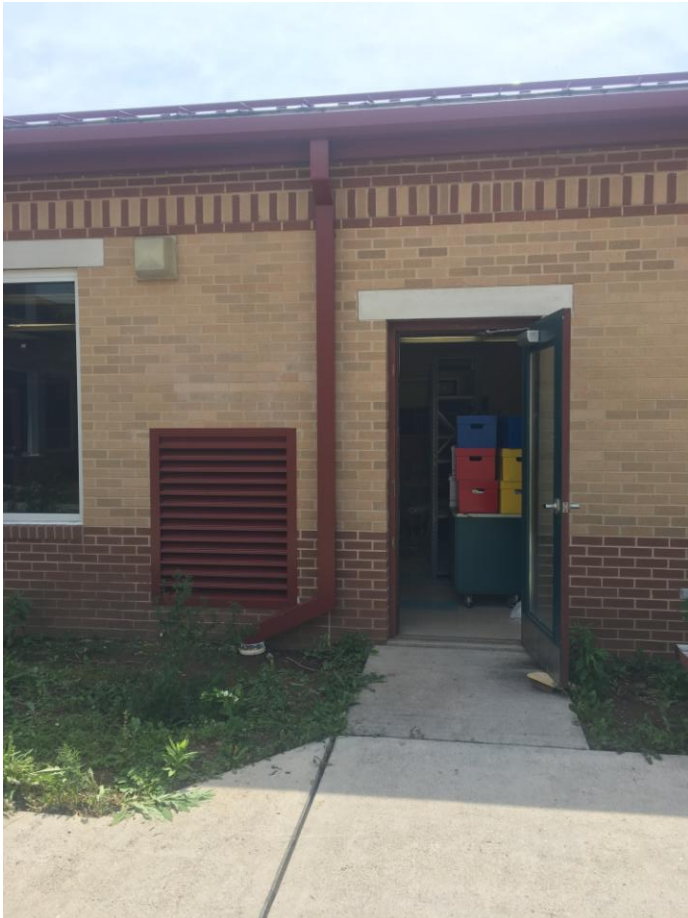
View of new gutters and downspouts at BES.