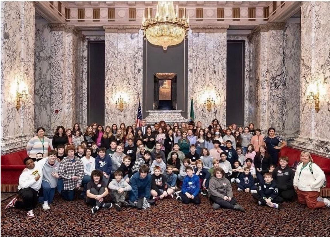
200 7th Graders got a chance to visit the Capitol! These lucky students got a civics lesson from Sen. Randall, Rep. Caldier and Rep. Hutchins. The students didn't have to pay for this trip due to a grant funded by the Suquamish Tribe.