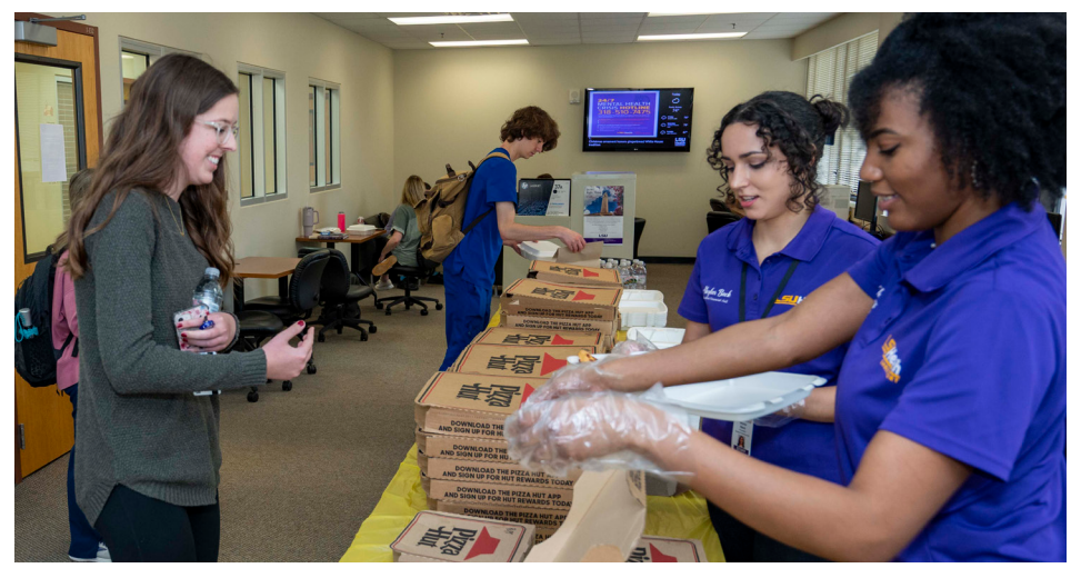
Student Financial Aid served pizza to Allied Health students for winning the FAFSA Completion Competition.

Welcome to the 2023 Spring semester! We hope you all have had a wonderful holiday season. The Student Financial Aid Office is committed to providing students with exceptional levels of service and continue our commitment with helping students achieve their financial needs. Best wishes and good luck with your studies this semester!