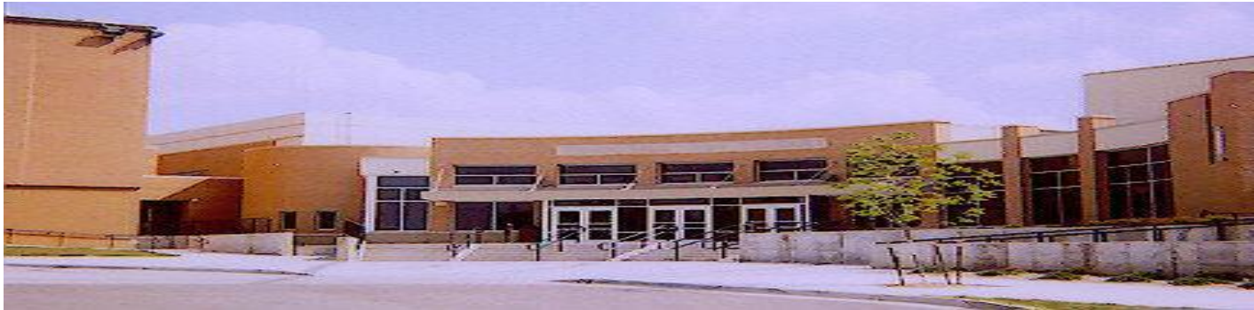
Park Hill High School