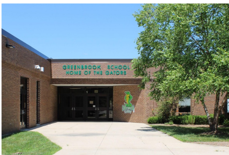
Greenbrook Elementary School Grades K-5