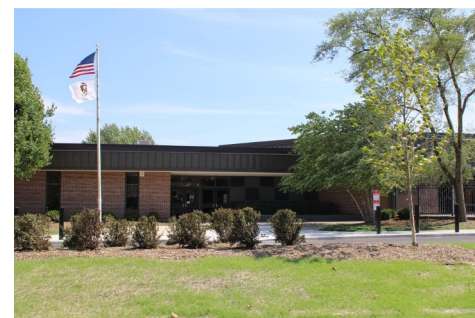
Waterbury Elementary School Grades K-5