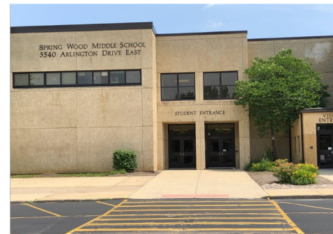
Spring Wood Middle School Grades 6-8