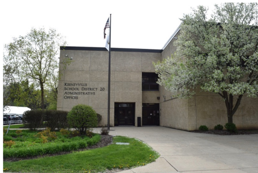
District Administrative Office