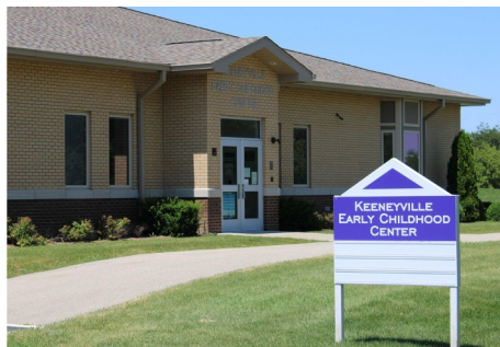
Early Childhood Center (ECC) Pre-Kindergarten