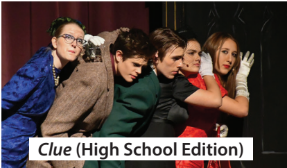
Clue (High School Edition)