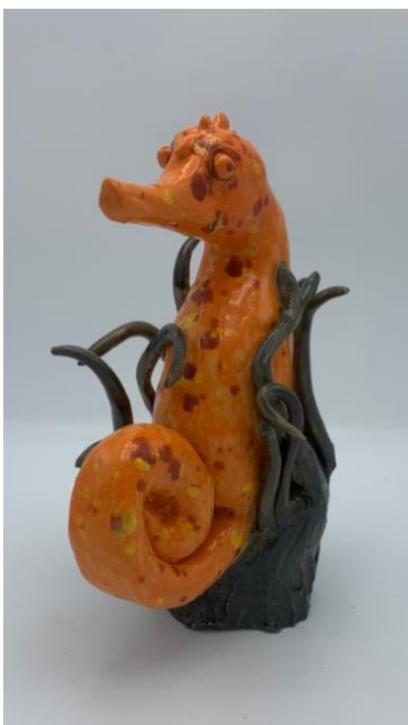
PHS Student Carly Matasavage 2017

Forensic Science II builds on the skills and knowledge from Forensic Science I. New topics are added including time of death, poisoning, odontology, arson, soil and tool marks. These topics include DNA analysis, glass fractures, document analysis, blood spatter analysis, casts and impressions and skeletal evidence. This is a hands-on, lab-based course involving class instruction, group work, and independent research of certain topic.