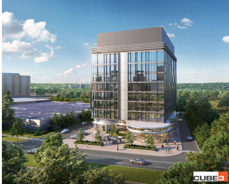
A rendering of RISE Together, a proposed project on Mystic Valley Parkway.

The City is also working with MassBIO to be designated as a “bio-ready” community, a list developed by the organization to help encourage the expansion of biotech in the region.