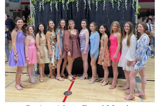
Senior girls at Grand March.

Newman students voted for one king and one queen, and the prom committee