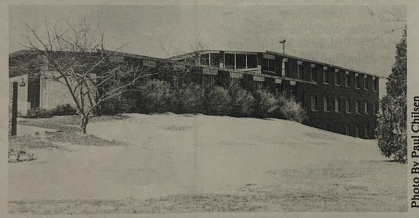
The second floor of the Newman Convent is now used by NCTI as a dorm for its visually and hearing impaired students.

In 1972, the convent became what is known as an intercommunity convent. This means that it became the home for sisters of a variety of religious orders. Even as an inter-community convent, though, the numbers of sisters in residence continued to diminish. In recent years, the Newman Convent had housed as few as three nuns, in a building designed for 26.