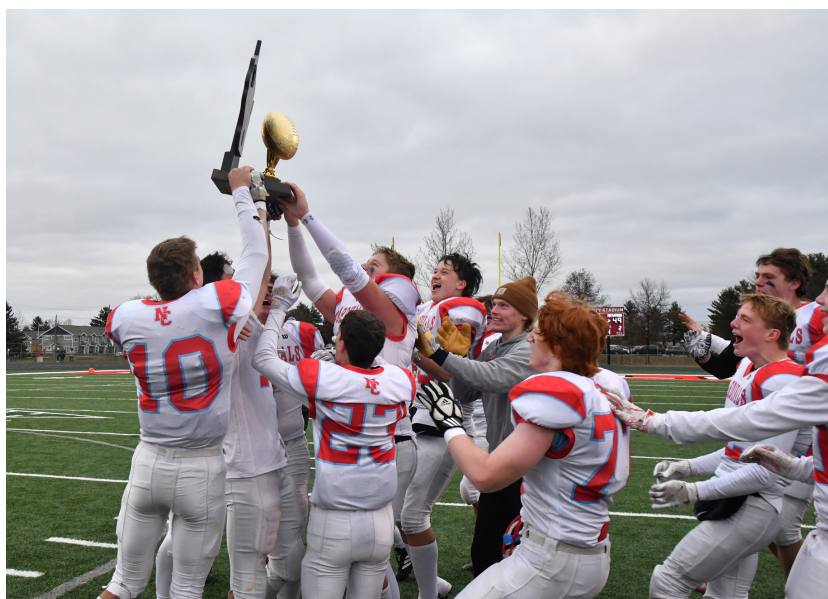
The Newman Cards celebrate after receiving the state championship trophy.