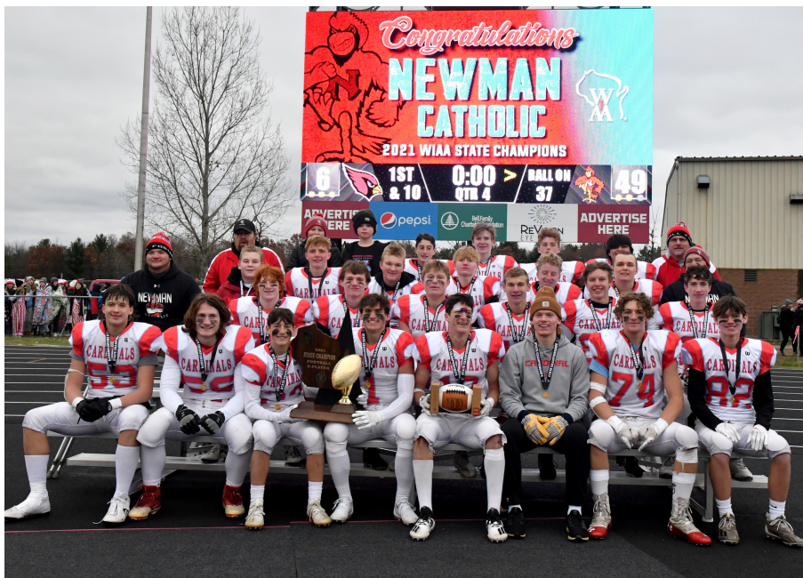
Team photo after defeating Luck in the State Championship.