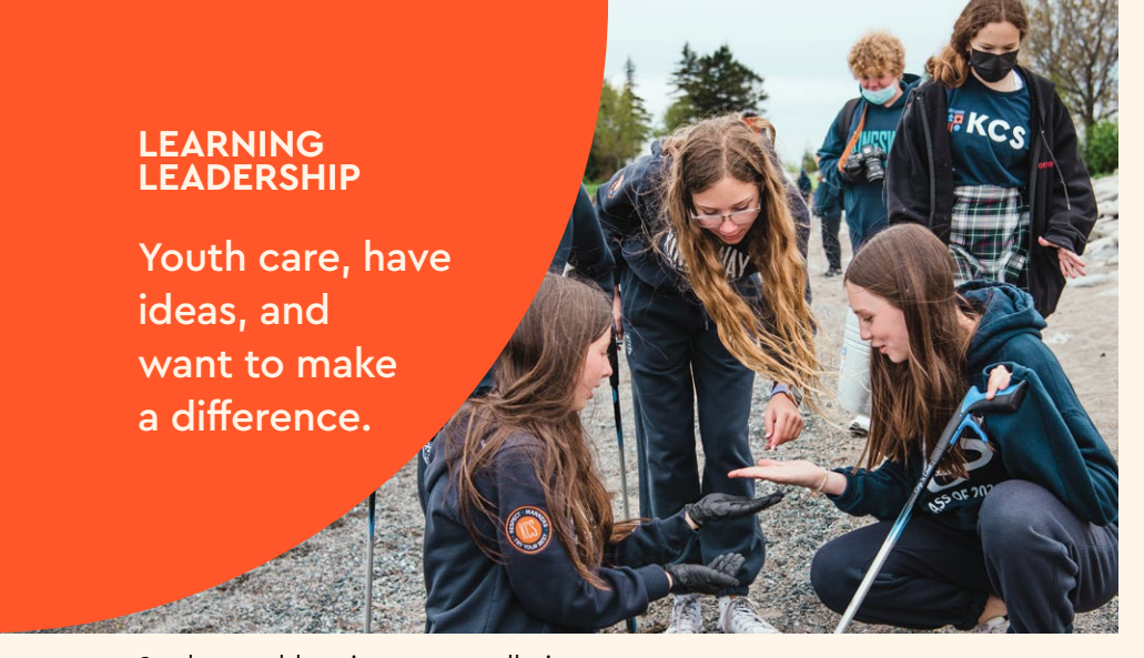
Students addressing water pollution

The KCS Senior School is designed to honour this fact and help all students grow as leaders. In our distinct KCS By Design Program, students and staff meet each week in self-selected groups to help build the school experience in academics, arts, athletics, citizenship, and spirit by following a design thinking process.