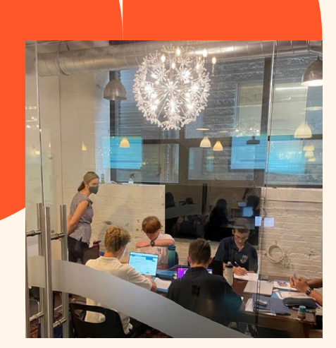
The Centre for Social Innovation

Beyond these four partners are limitless opportunities, formal and informal, where we look forward to connecting students with external experts. To learn more about this feature of the Senior School, please visit our KCS Learning Community webpages. Readers interested in becoming a Learning Partner can learn more here.