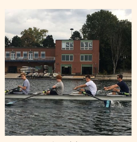
Argonaut Rowing Club