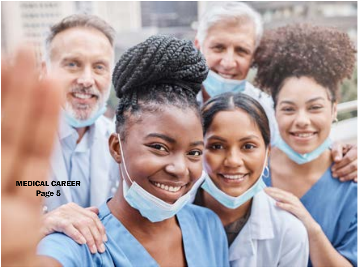
MEDICAL CAREER Page 5