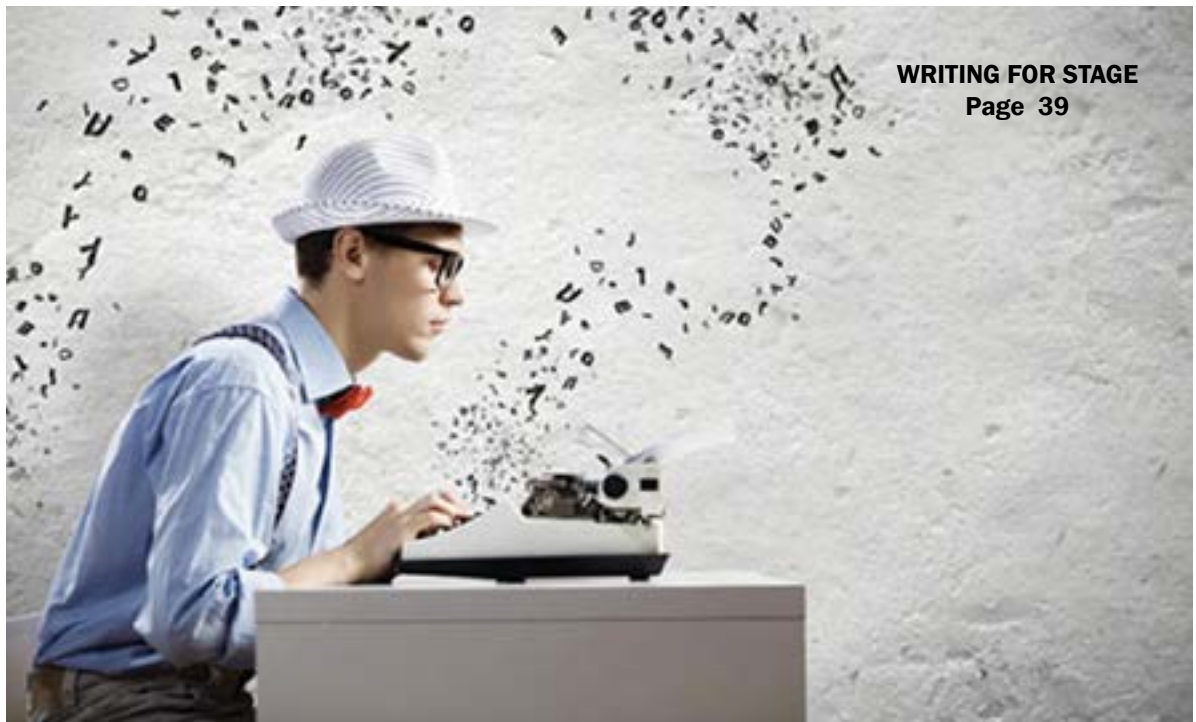
WRITING FOR STAGE Page 39

Please see school policies on page 4. ALC classes are only for students 18 years and older.