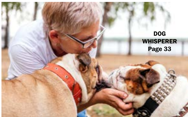
DOG WHISPERER Page 33

Register by mail or in person at the Adult Learning Center. Once you have scheduled course times with the instructor, the ALC requires 24 hours' notice to cancel a course meeting time. If notice is not given, you will forfeit that meeting time and it will not be rescheduled. All classes must be completed within one month of scheduled first class and/or before the semester ends. Written documentation is required for an extension to be granted due to unforeseen circumstances. This applies to all 1-on-1 classes in the catalog.