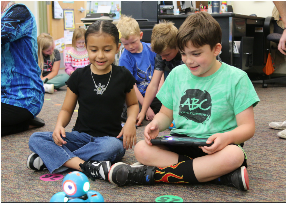
In Adams 12 Five Star Schools, students begin learning computational thinking and advanced problem solving at a young age through computer science.