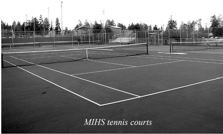
MIHS tennis courts