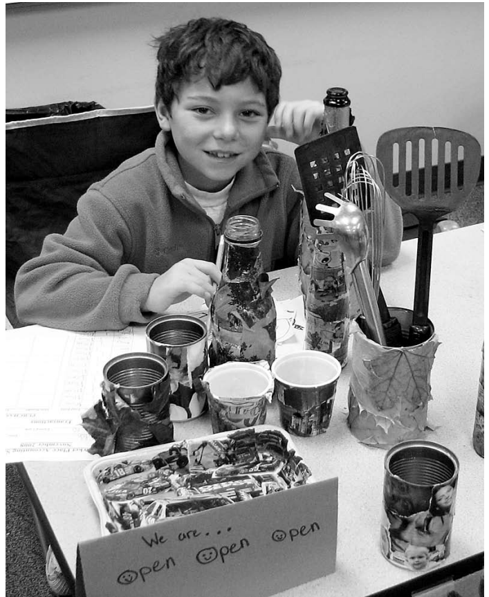
An exciting culmination to learning about business plans and product marketing: This West Mercer student sells his wares to other students, teachers, and parents on Marketplace Day.