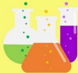
Science Enrichment Activities