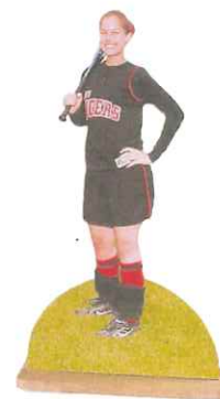
J Photo Statuette $29.00

Please give your order envelope, with payment enclosed , to the photographer.