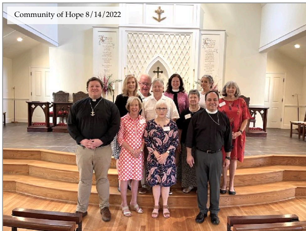
Community of Hope 8/14/2022

Community of Hope International is a Christian community united in prayer, shaped by Benedictine Spirituality and equipped for service in pastoral care ministries. As Lay Chaplains, this group assists the clergy in the pastoral care of the parish and are available for a one time check in (hospital stay or followup) or a long term commitment (homebound or resident at a nursing home) depending on the situation. These Lay Chaplains are members of St. James that provide a listening presence and come alongside anyone who may be feeling lonely, distressed, or facing the many challenges of life.