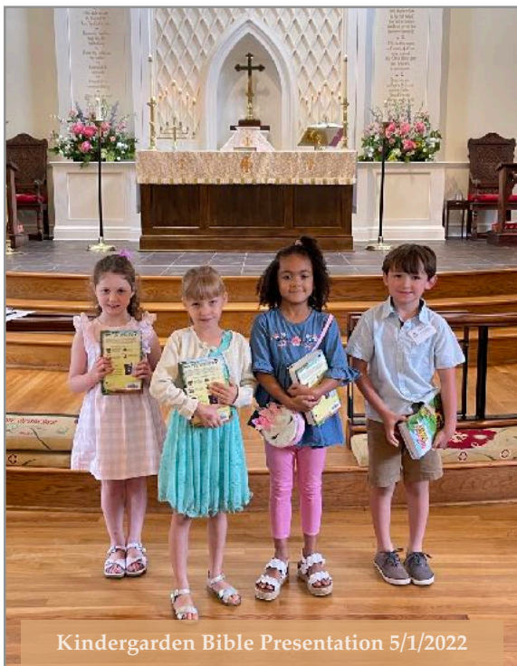
Kindergarden Bible Presentation 5/1/2022