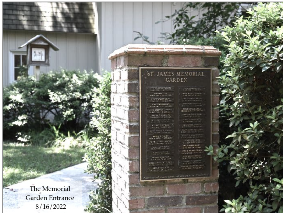
The Memorial Garden Entrance 8/16/2022

The St. James Memorial Garden, located behind the sacristy, is a sanctified location to be used by the communicants of St. James and their immediate families for interment of their ashes (cremains) either in the ground or in a niche in the columbarium wall. The members of the Memorial Garden Board handle all facets of the Memorial Garden including meeting with families, transporting cremains, preparing plots and opening niches, assisting with Memorial Services, and conducting the financial business of the Board.