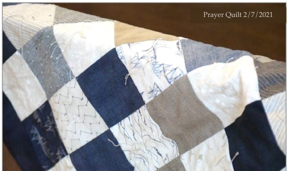
Prayer Quilt 2/7/2021

Prayers & Squares is a ministry that combines the pastoral gift of a hand-tied quilt with the gift of prayer for someone in need. The quilts are a statement of our faith, a testimony to our strong belief in God, and in the ultimate power of prayer. You do not need to be experienced in quilting to be a part of this ministry. If sewing is not your thing, you can help in other ways.