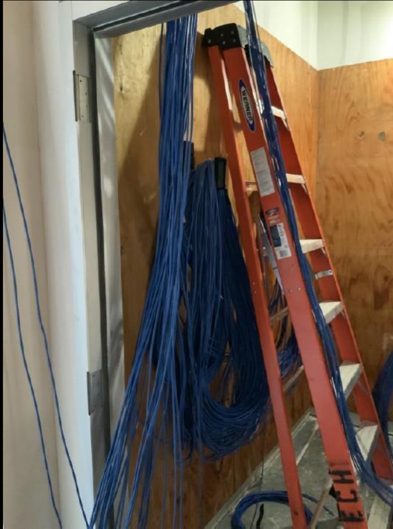
Pulling data cables to the Main Distribution Frame (MDF).