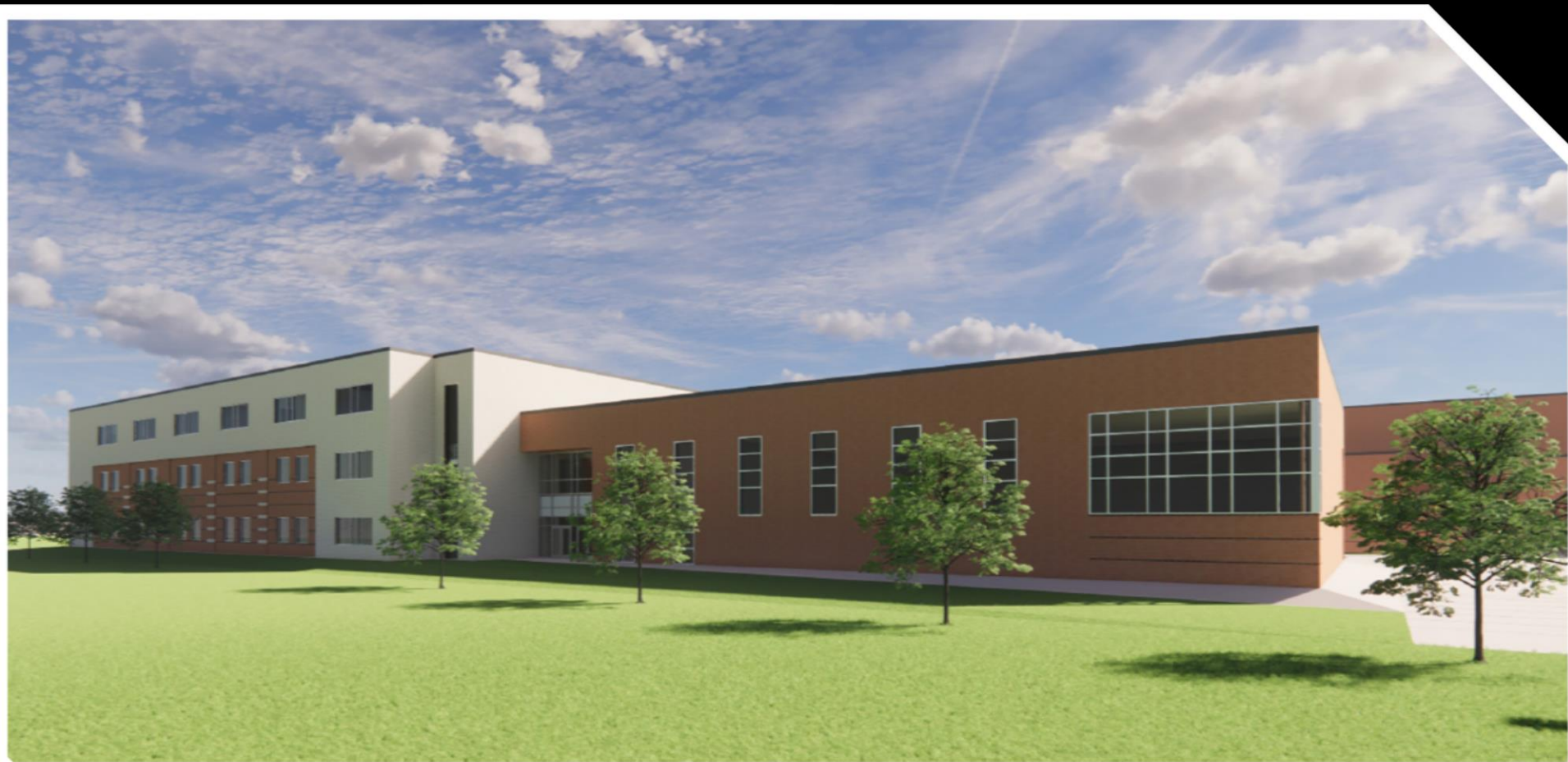
instruction addition - north entrance