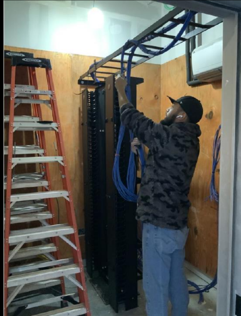
Bundling of data cables to the MDF