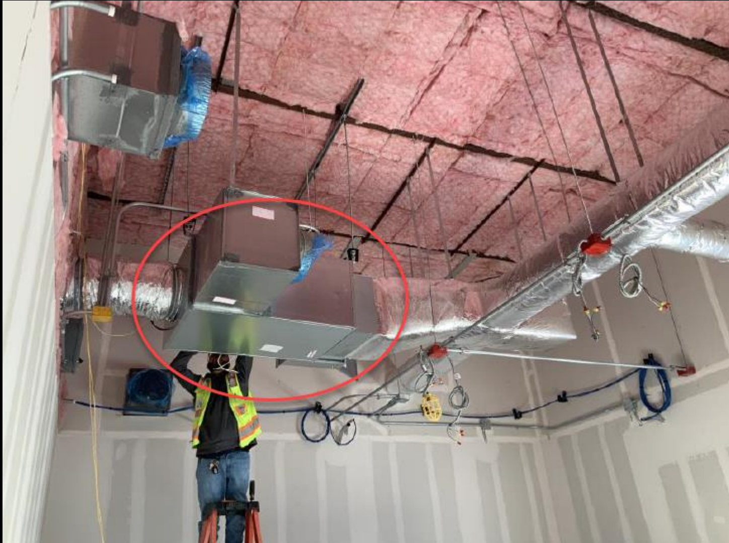
Connecting low voltage wires to the Fan Variable Air Volume (FVAV) equipment.