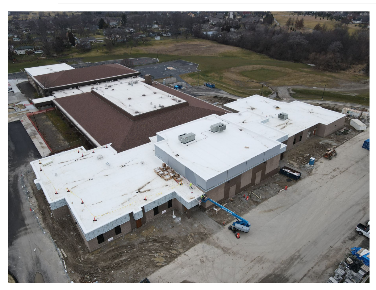
East Additions Exterior Facebrick