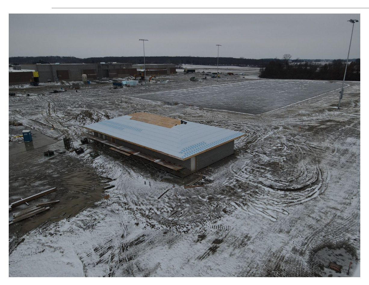
Community Building and Football Field