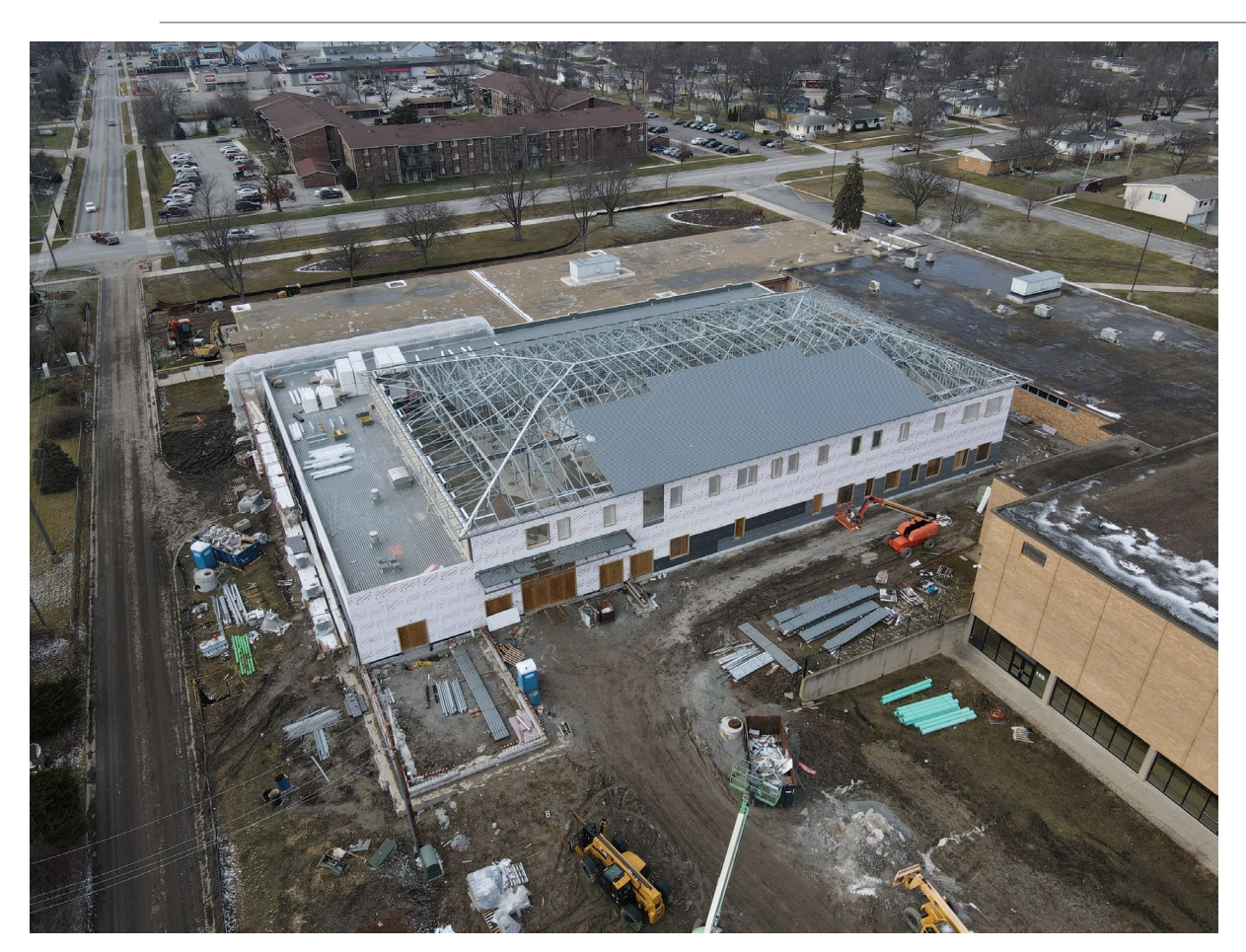
New Administration Center Roofing