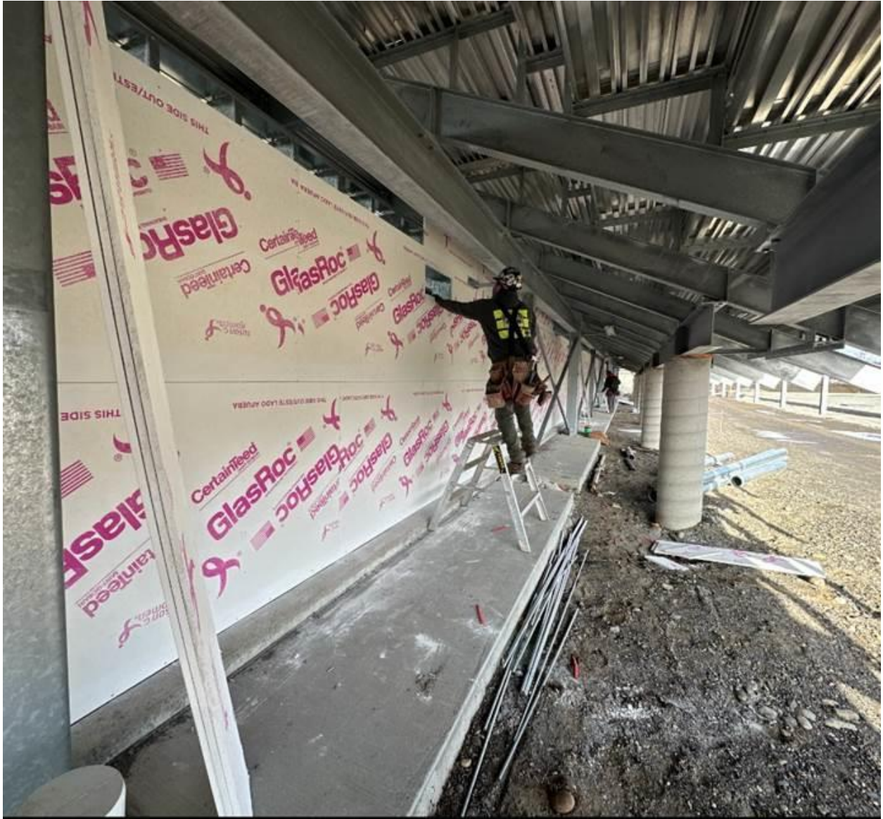
Exterior sheetrock being installed on the grandstands' concession area