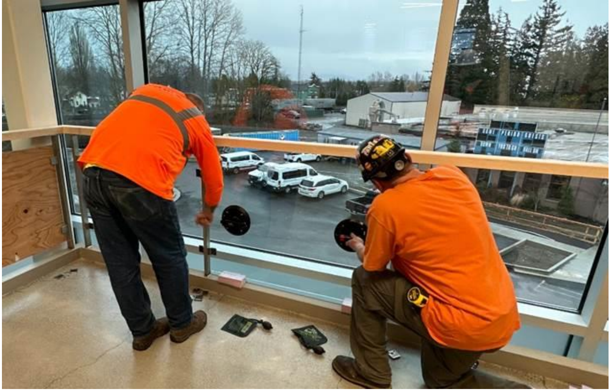
Crews installing the glass guardrail panels at the Academic Wing central staircase