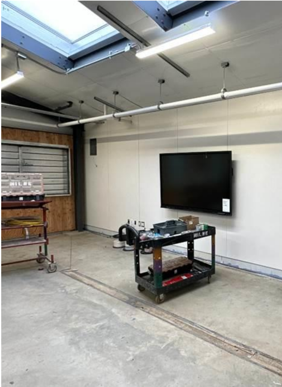
Finishing touches in the Aquaculture Building