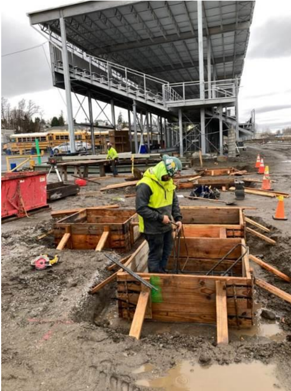
Installation of the foundation that will support the ramp leading up to the grandstands