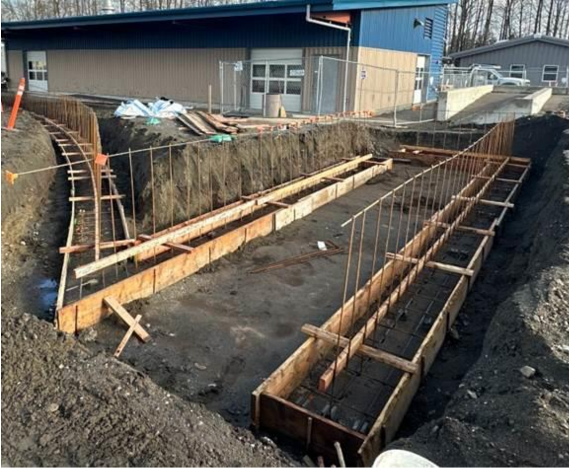
Ramp foundation between the weight room and new football field