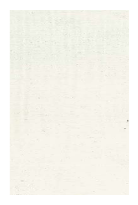
Alvarado New Linen

SHERWIN-HILLIAMS 7708 03/29/16 Order# 0000000 817-645-2381