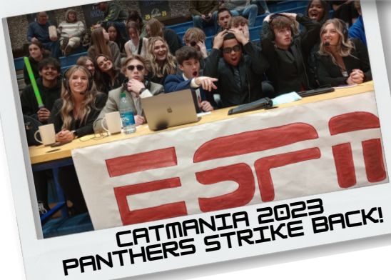
CATMANIA 2023 PANTHERS STRIKE BACK!