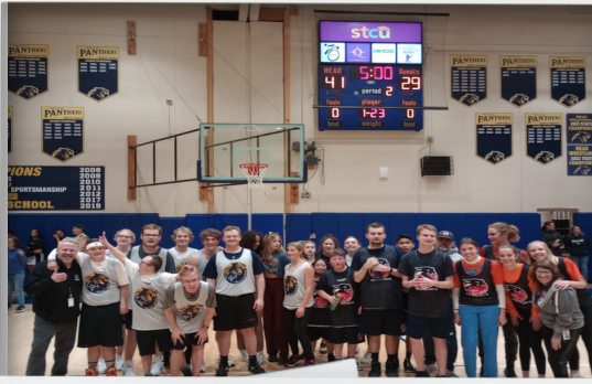
PANTHER UNIFIED WHOPS THE WILDCATS AT CATMANIA 2023!