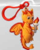
RECAUDA $5: Hearty