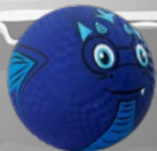
$75: Pelota Plástica*