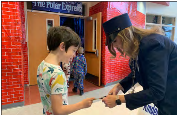
Boulton students board the Polar Express

The King of Rock and Roll visited students at Bluff Ridge Elementary to bring holiday cheer. A special