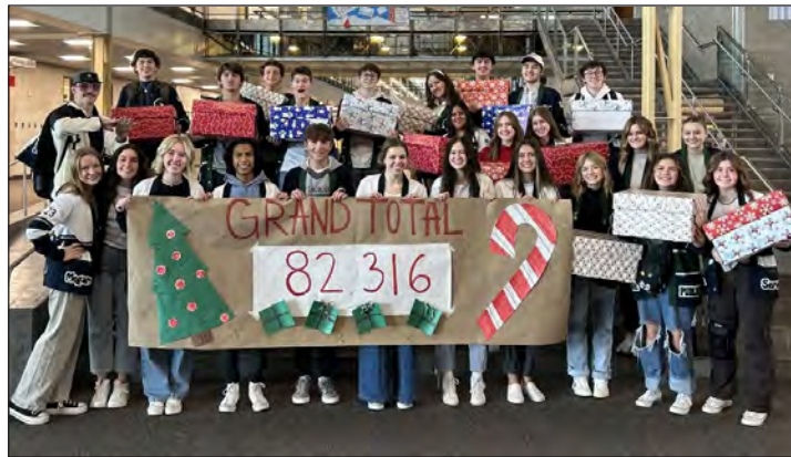
Syracuse High students wrote 82,316 letters to Santa

Reading Elementary's Student Council facilitated See CHEER, Pg. 2