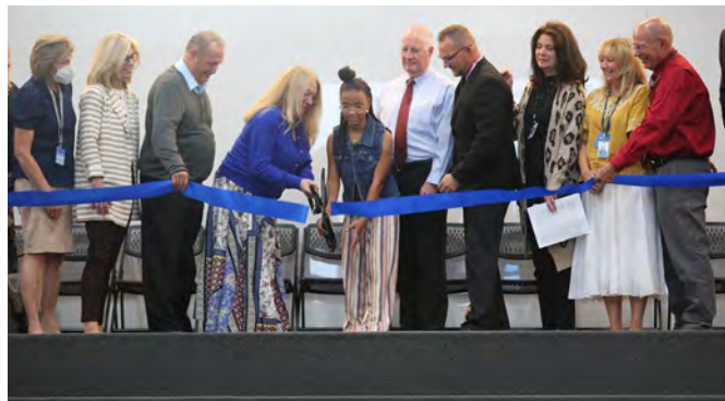
Board Members at the South Clearfield Elementary ribbon cutting.