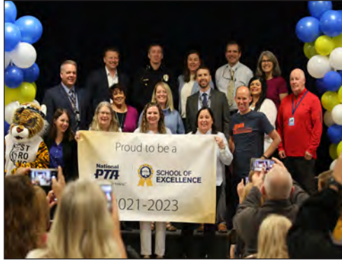
Tolman Elementary School of Excellence Award

• In the month of November, six student teachers were awarded $500 scholarships to go towards finishing their teaching degrees. The annual scholarships were created in honor of former teachers and are presented by the Department of Professional Learning and Quality Staffing.