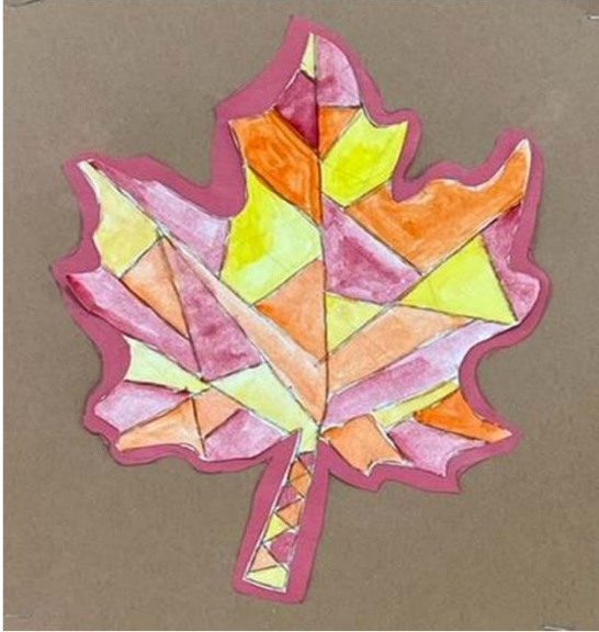
Tasruba Poshpita, Grade 5, Hart