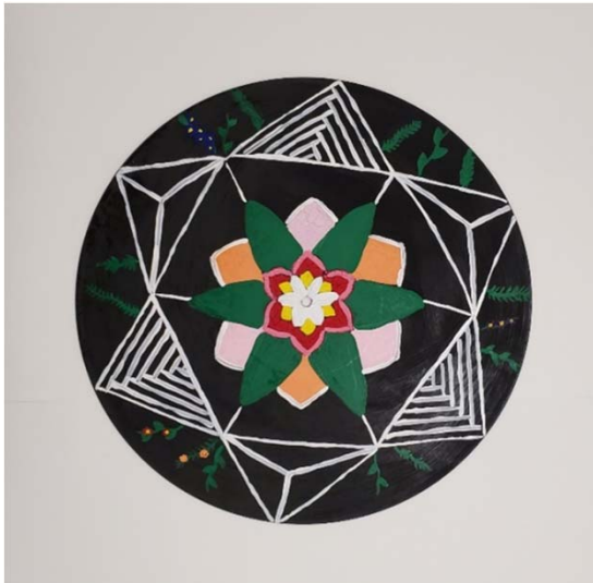
Abigail Oblenda, Grade 3 Rogers International