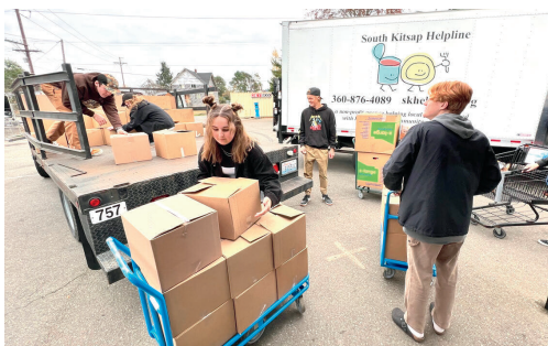
SKHS students collected more than 2000 food items to support South Kitsap Helpline.