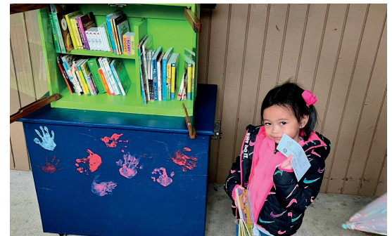
Preschool student with her book at the Madrona Heights Little Library

The Kurt Wagner Education Fund, South Kitsap Kiwanis, Rotary of South Kitsap, and Port Orchard Rotary provide invaluable assistance through a variety of programs like classroom reading, scholarships, student recognition and much more. The Little Library shown in the photo was donated by the Kiwanis Club of Port Orchard.