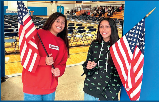
Student leaders at John Sedgwick Middle School