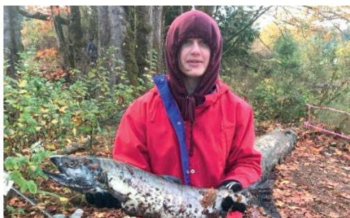
SKHS students took a field trip to study salmon habitat and spawning.