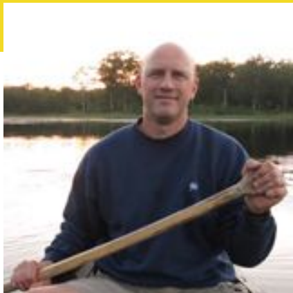
Jim Cummings Last Names A-Z