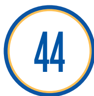
Highest diploma points awarded to a candidate