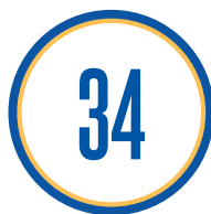
Average points obtained by candidates who passed the diploma