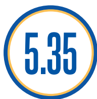
Average grade obtained at the school by candidates who passed the diploma