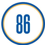
Number of candidates registered in the session