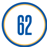
Number of diploma candidates registered in the session