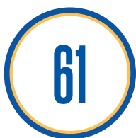
Number of candidates who successfully passed the diploma