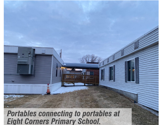
Portables connecting to portables at Eight Corners Primary School.

Scarborough's 2021 birth rate was over 25% higher than the average of the last 10 years. This will impact 1st Grade in 2027-2028 .