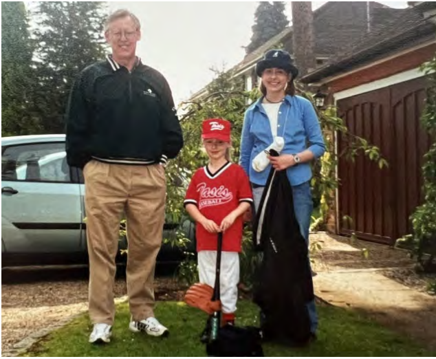
At home in her TASIS First Grade Baseball kit!