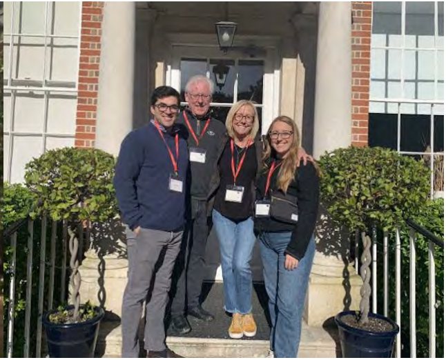
22 years later and smiles all round on the steps to our Lower School building.