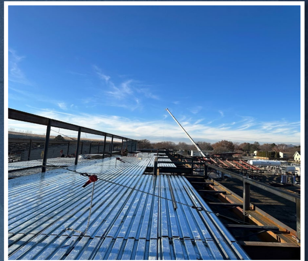
Roof Deck Install Ongoing Area B