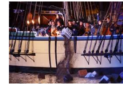
Boston Tea Party (Complete paragraph).