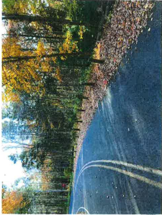
Current wire rope guide rail on Baker Road