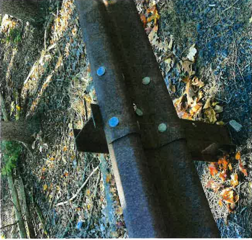
Weathered Guardrail on Reservoir Road