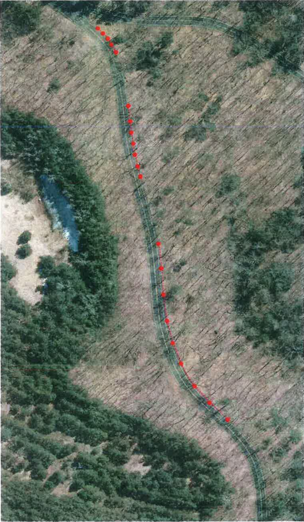
Location of Proposed Guardrail replacement on Baker Road