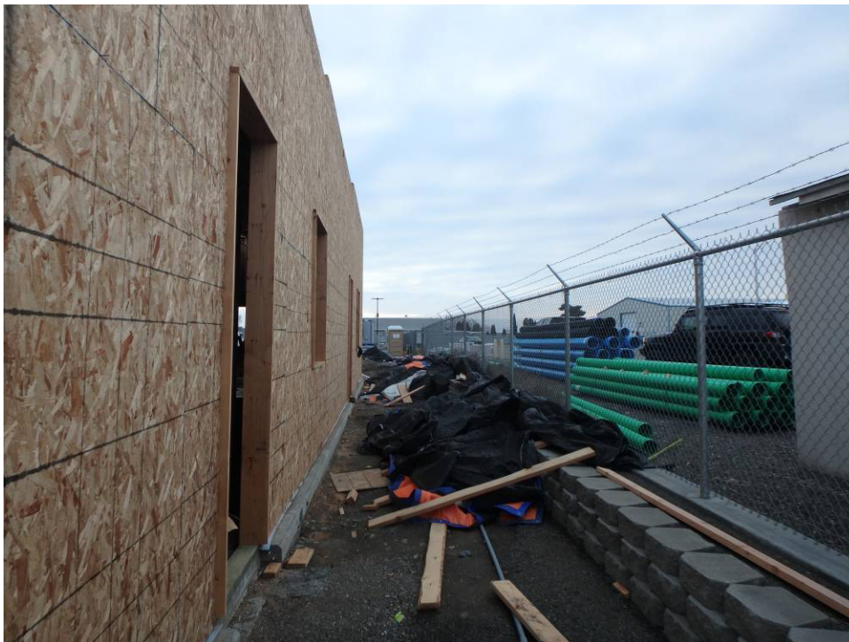
Looking east along the north wall