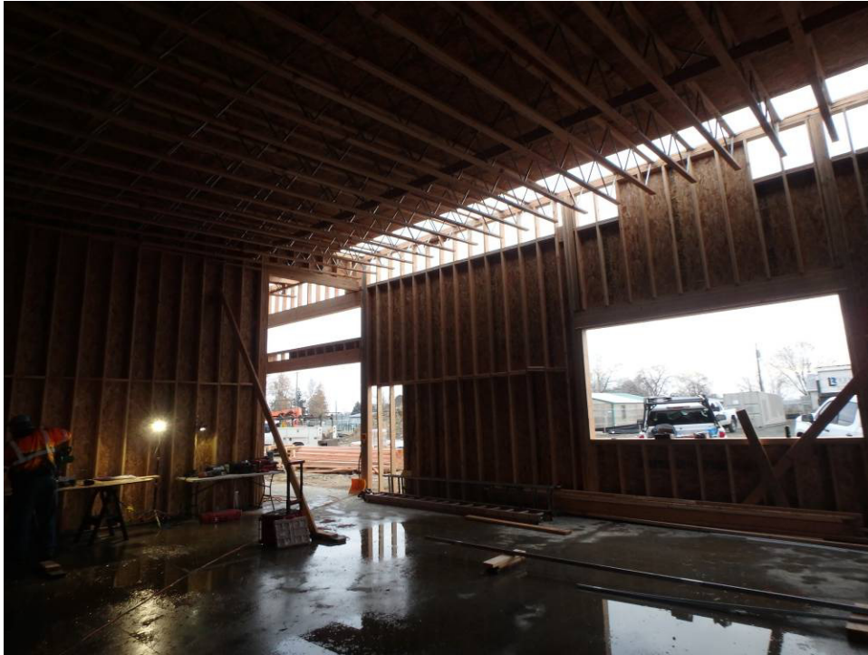
Looking northeast at the classroom (southeast room) framing, sheathing and roof framing