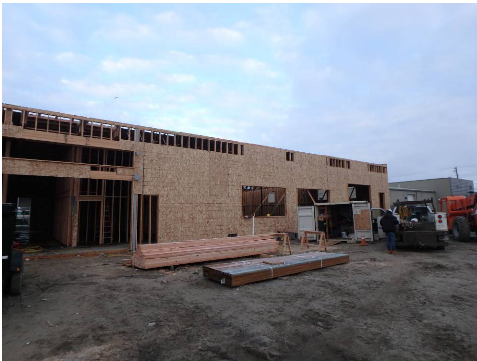
East wall north end