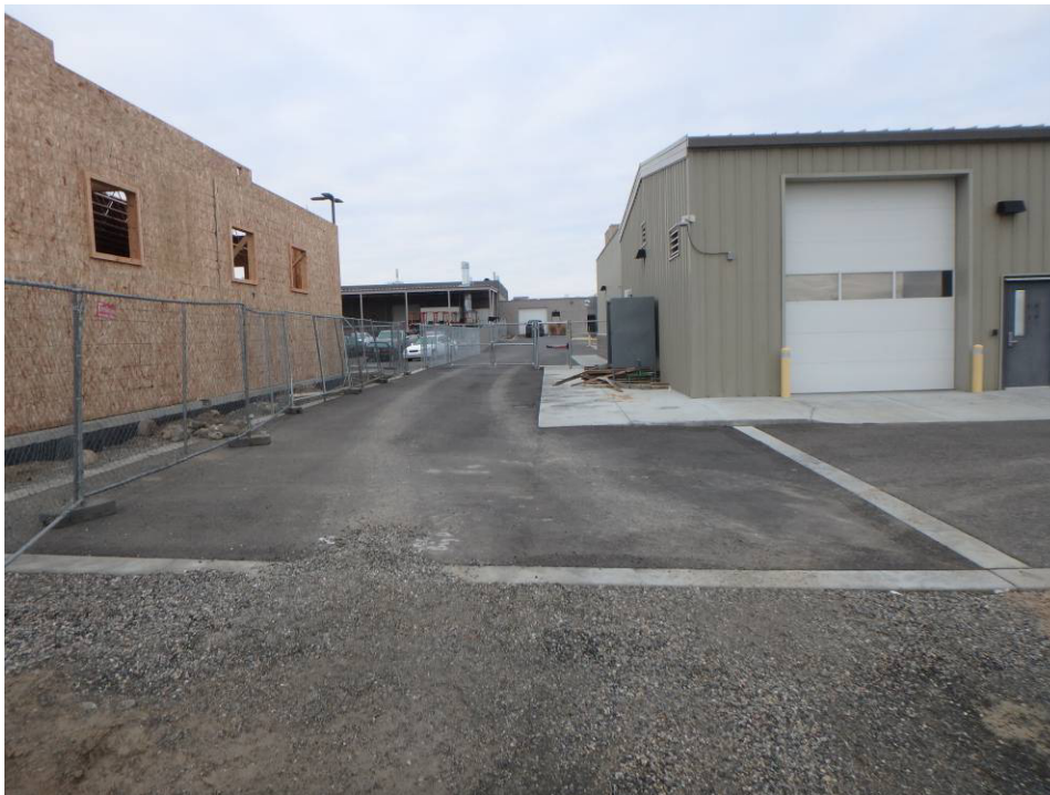
Looking west at the North drive