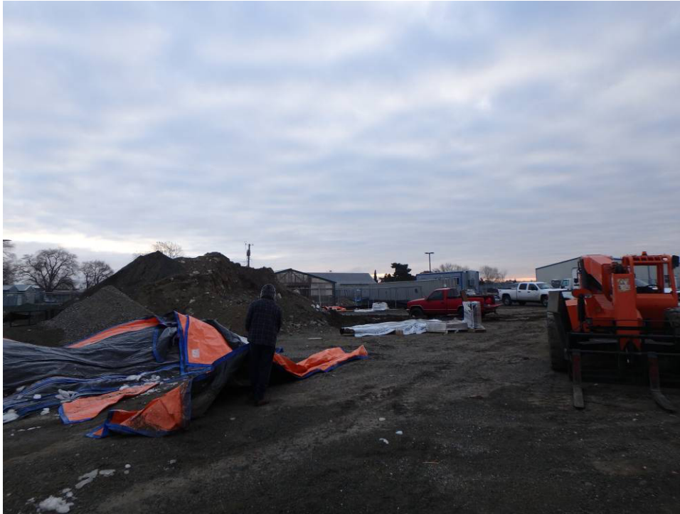
Looking southeast across the site