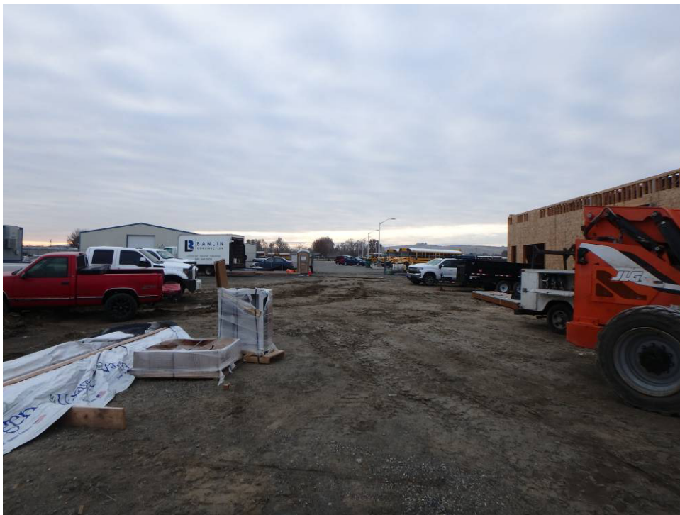
Looking south across the site at the site entry