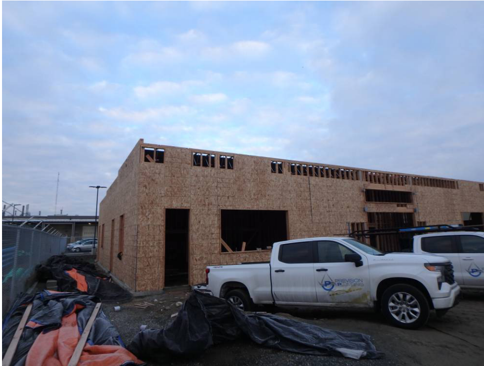
East wall south end