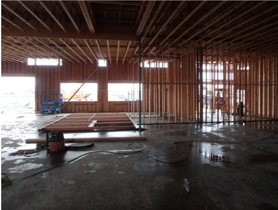
Looking east at the central framing in the building