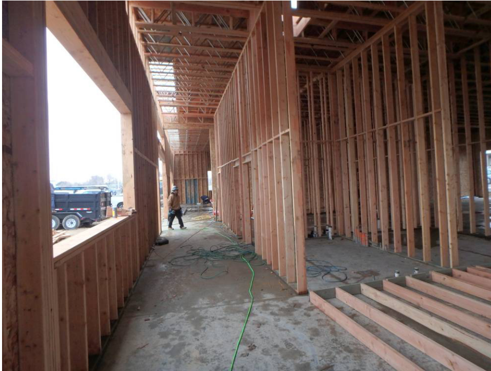
Looking south along the east corridor