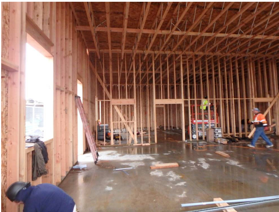
Looking west at the classroom (southeast room) framing, sheathing and roof framing along the south wall and lab and kennel room beyond