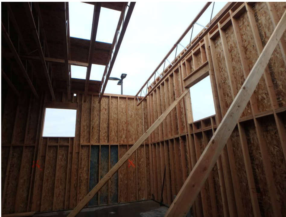
New roof trusses at the northwest corner