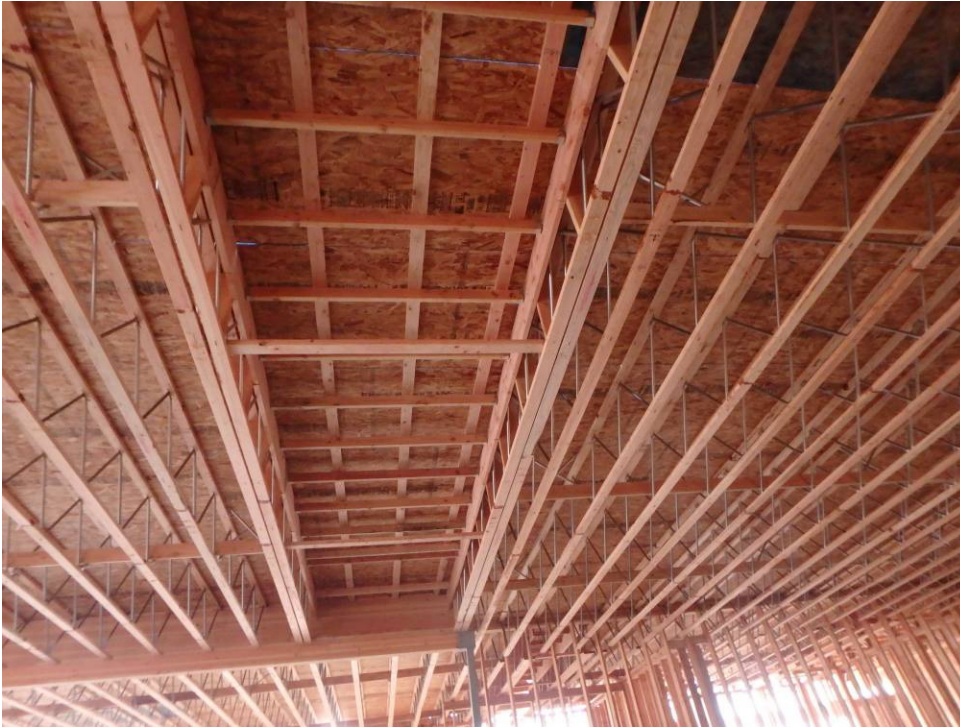
Looking east at the roof trusses and sheathing