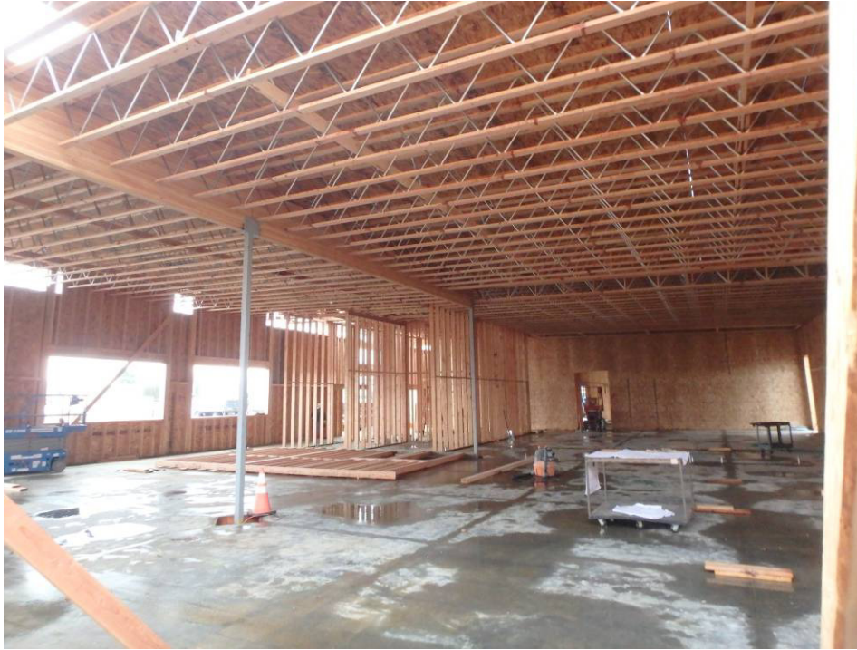
Looking southeast at the central wall and set trusses