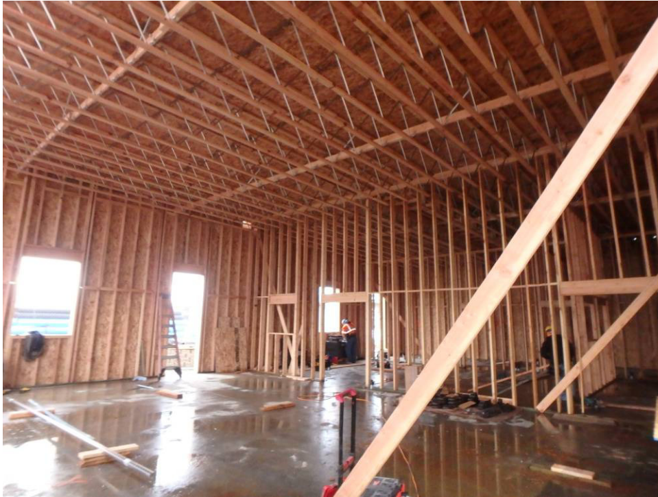
Looking southwest at the classroom (southeast room) framing, sheathing and roof framing