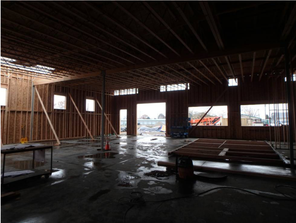
Looking northeast at the northeast corner of the building