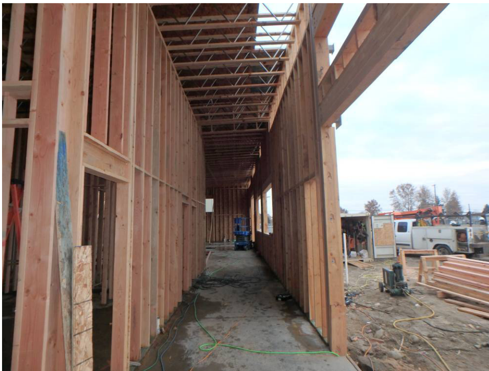
Looking north along the east corridor