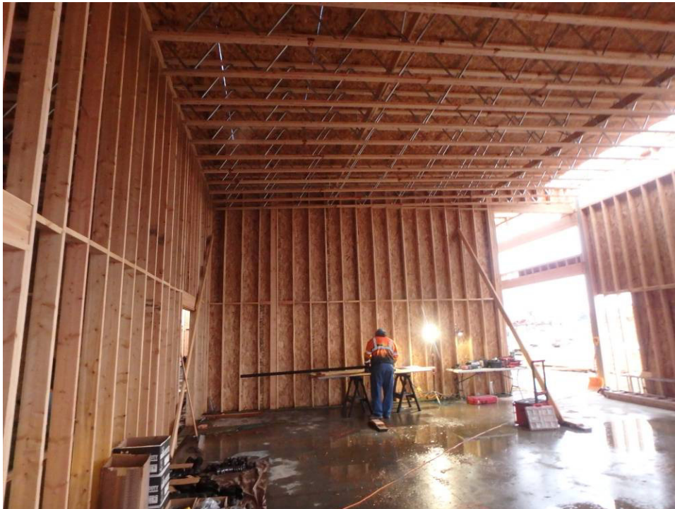
Looking north at the classroom (southeast room) framing, sheathing and roof framing