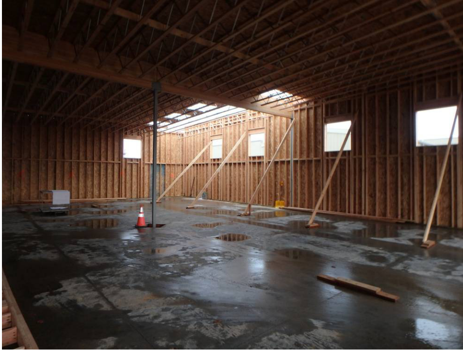
Looking at the northwest corner of the building and the roof opening