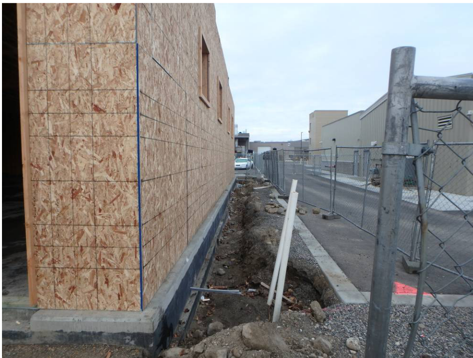
Looking west along the exterior of the north wall and north property line