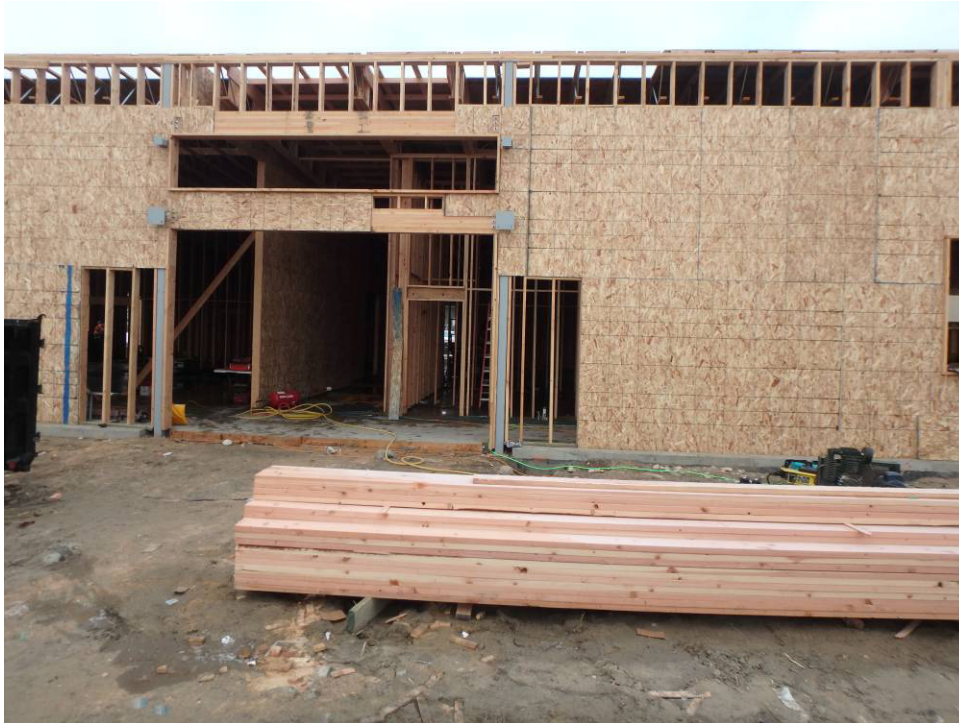
Looking at the east entrance