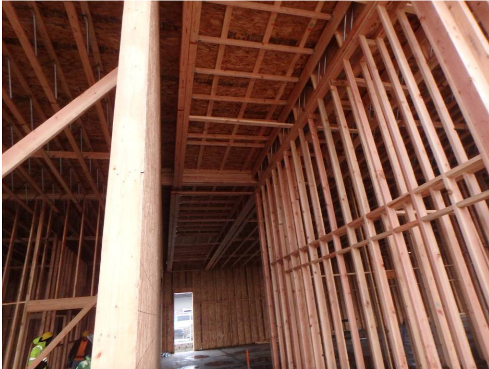
Framing of the east-west corridor