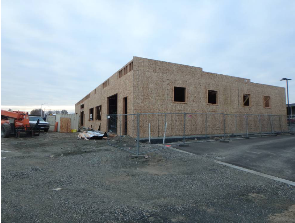
Looking at the northeast corner of the building