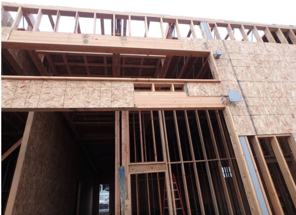
New roof trusses