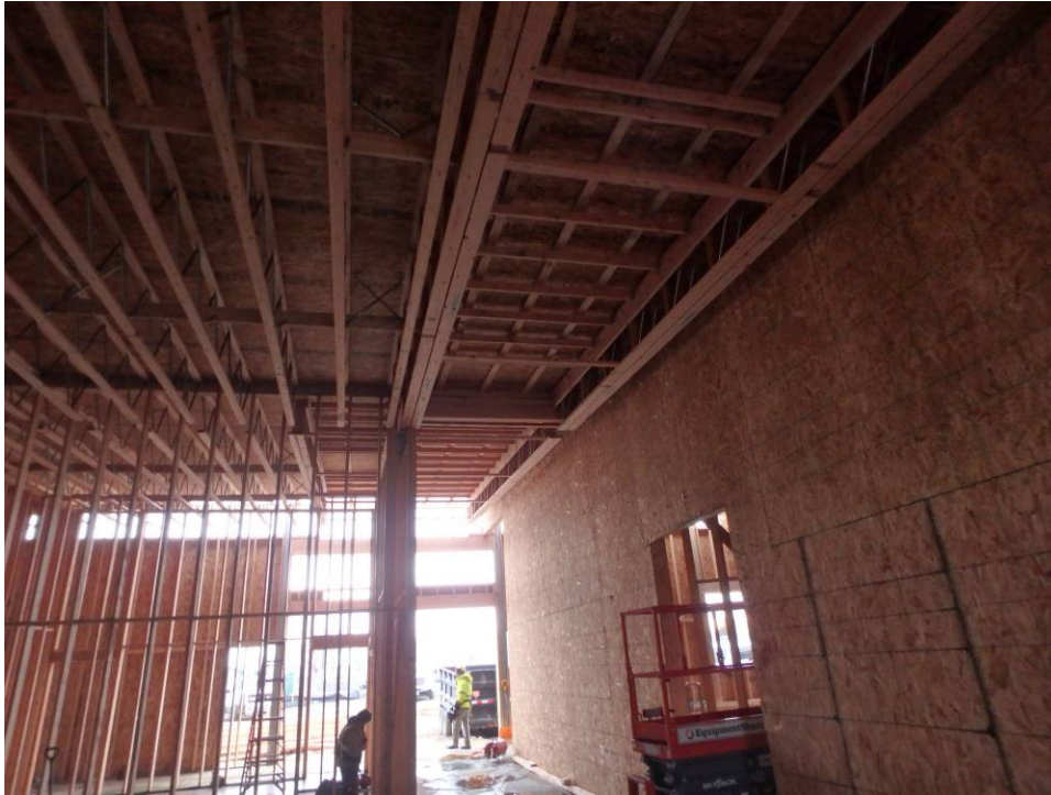
Looking east at the central east-west corridor framing and roof trusses