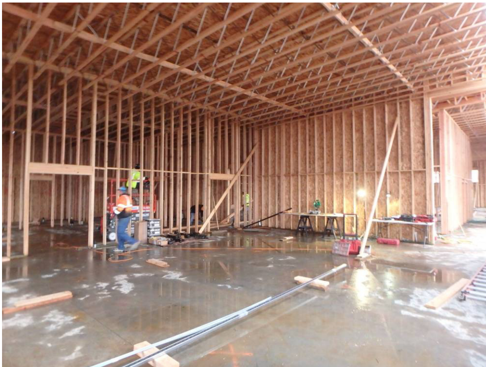
Looking northwest at the classroom (southeast room) framing, sheathing and roof framing