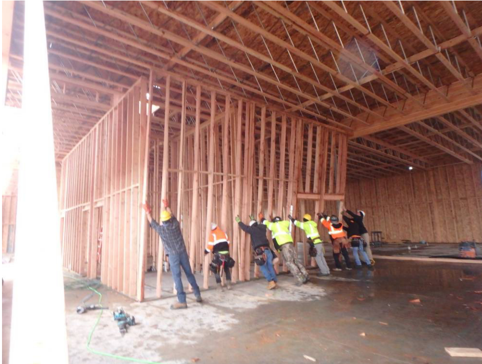
Raising the wall