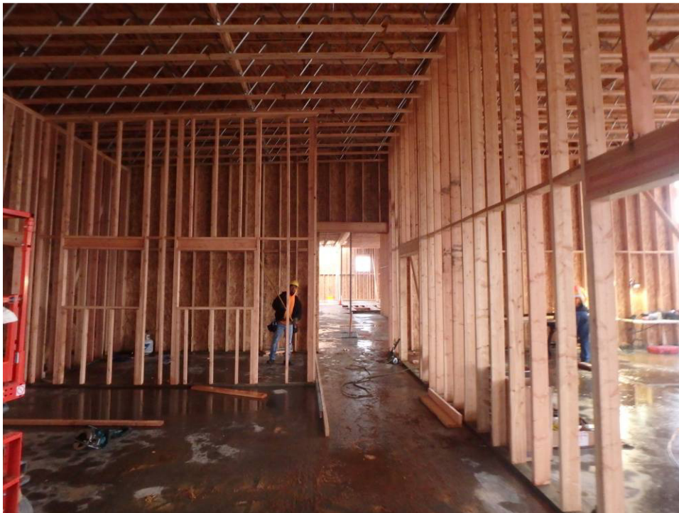
Looking north through the lab and the central east-west wall