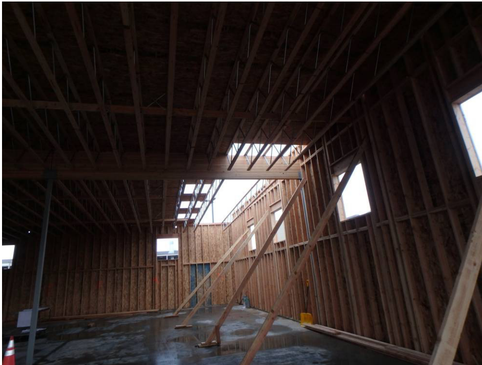
Looking at the northwest corner