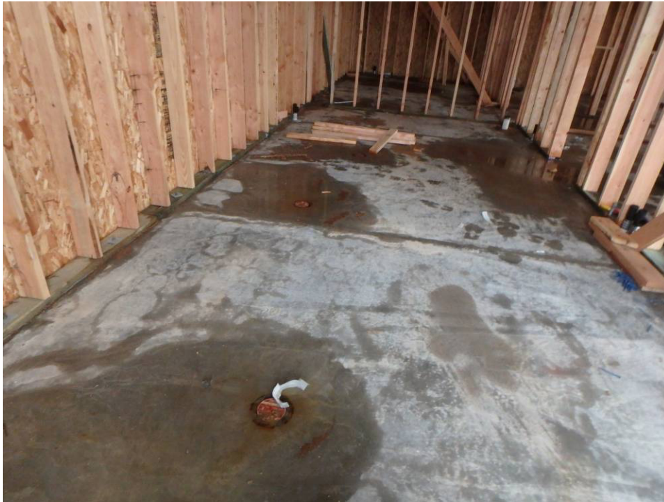
Kennel (southwest) room