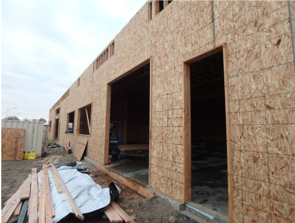
Looking south at the east wall framing and sheathing