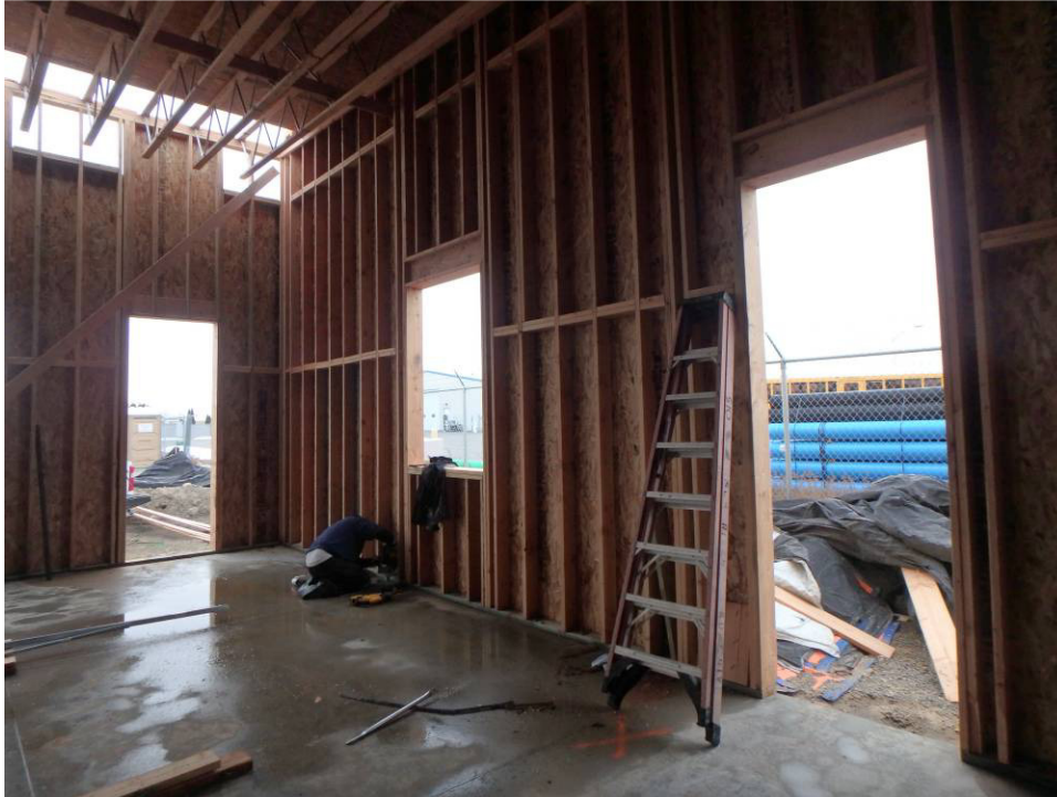
Looking southeast west at the classroom (southeast room) framing, sheathing and roof framing