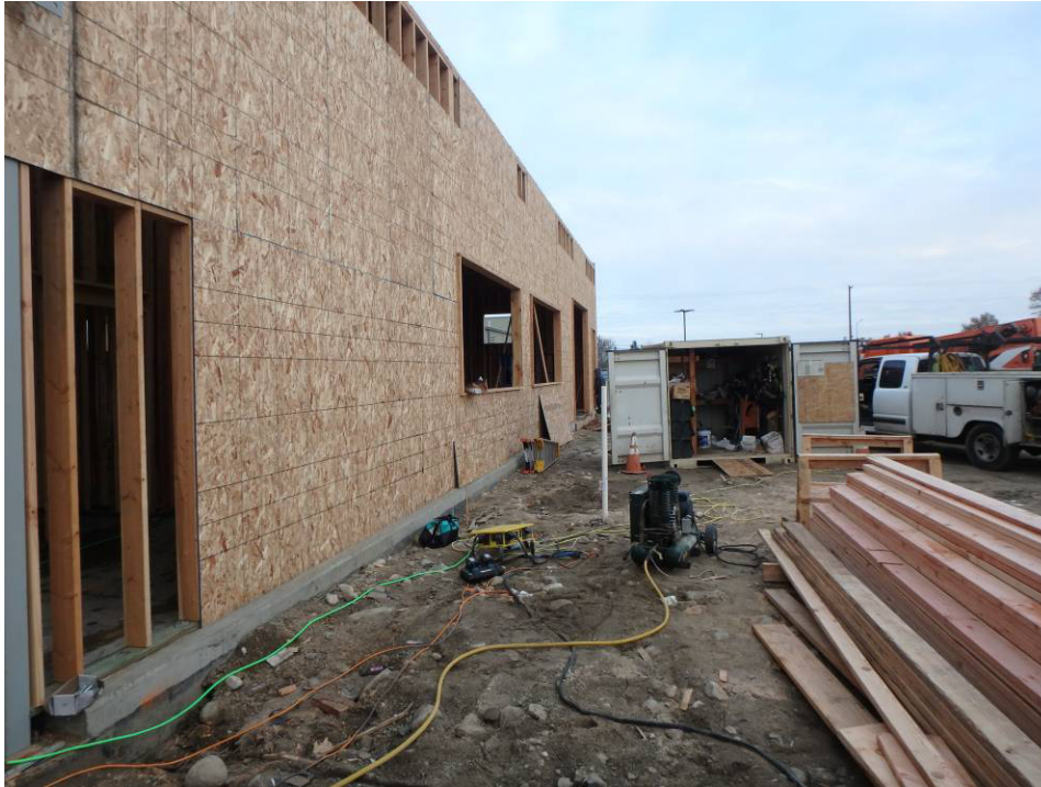
East wall sheathing