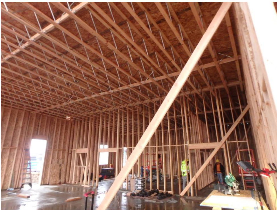
Roof trusses and sheathing in the south rooms