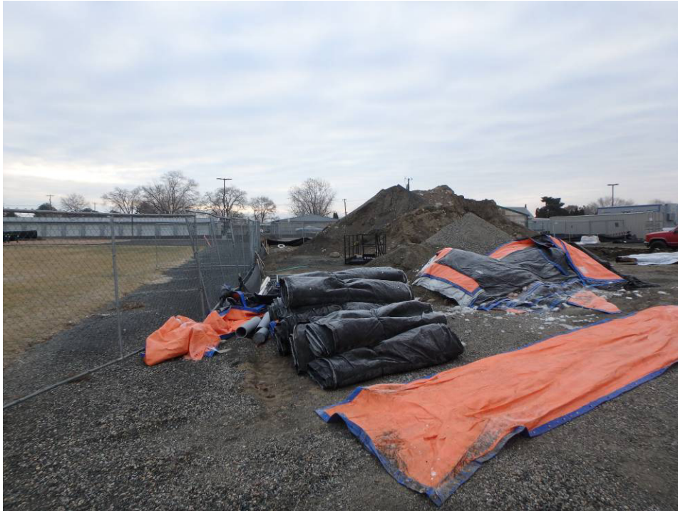
Looking east at the north property line