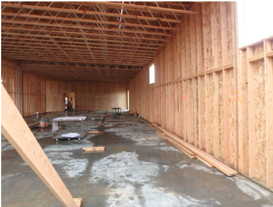
Looking south along the west wall