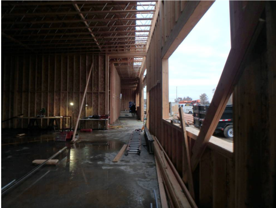
Looking north at the classroom entrance through to the east corridor