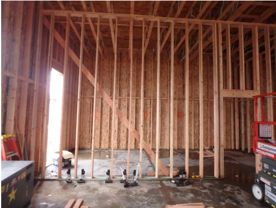
Plumbing stub-ups for the dog washes from the lab South center) room side through to the kennel