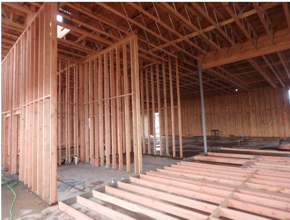
Wall framing in the north half of the building