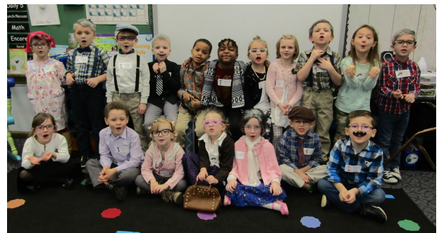
Kindergarteners celebrate 100 days of learning!