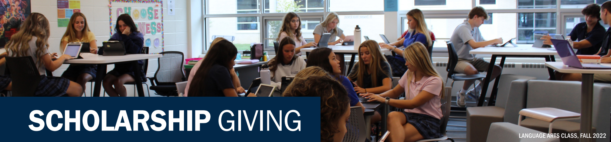
LANGUAGE ARTS CLASS, FALL 2022