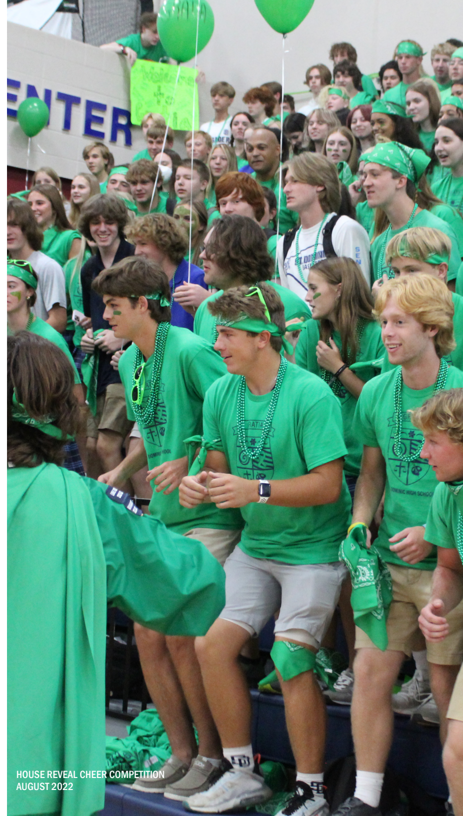
HOUSE REVEAL CHEER COMPETITION AUGUST 2022

AT&T Foundation Altria American Online Giving Foundation, Inc Bahama Buck's Bass River Resort Buffalo Wild Wings Casey's General Store Compass Mercy Conference and Retreat Center Costco Wholesale Dogwood Social House Hoskins Leather Craft Jersey Mike's Subs K & B Custom Designs LLC Magic House Missouri Botanical Garden Monical's Pizza Never Enough Boutique Nothing Bundt Cakes O'Fallon Nutrition Old Town Donuts Salon De Christe School Sisters of Notre Dame Serenity Now Float Spa Smoothie King St. Dominic Athletic Association St. Louis Symphony Sunflower Hill Farm Sweetology Tacos 4 Life The Dinner Bell The Glass Work Bench The Little Gym Upshot Coffee Walter Knoll Florist WestInn Kennels